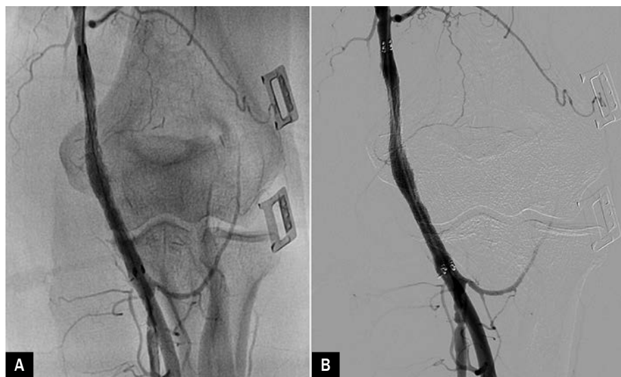
Figure 3A. Deployed stent with complete sealing of aneurysm; B. Digital subtraction arteriography showing little expansion at the proximal edge (B)

of endovascular treatment is that associated stenosis can be treated simultaneously.