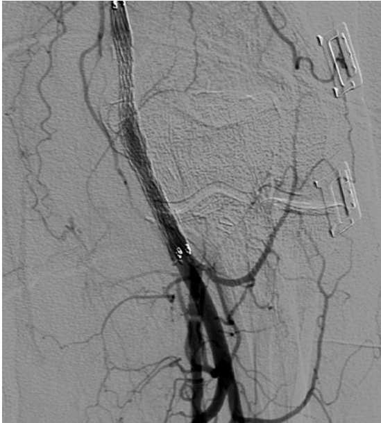
Figure 4. Digital subtraction arteriography showing remodelling of stent as evident by much better expansion at the edges after 5-minute interval

Stent Graft placement. It has excellent radial strength which provides perfect expansion force and in combination with the 2 mm flared ends, minimise the risk of stent graft dislocation or migration. Its design gives minimal stent graft foreshortening during deployment which further enhances placement accuracy. The Fluency Plus vascular stent graft is MRI safe.