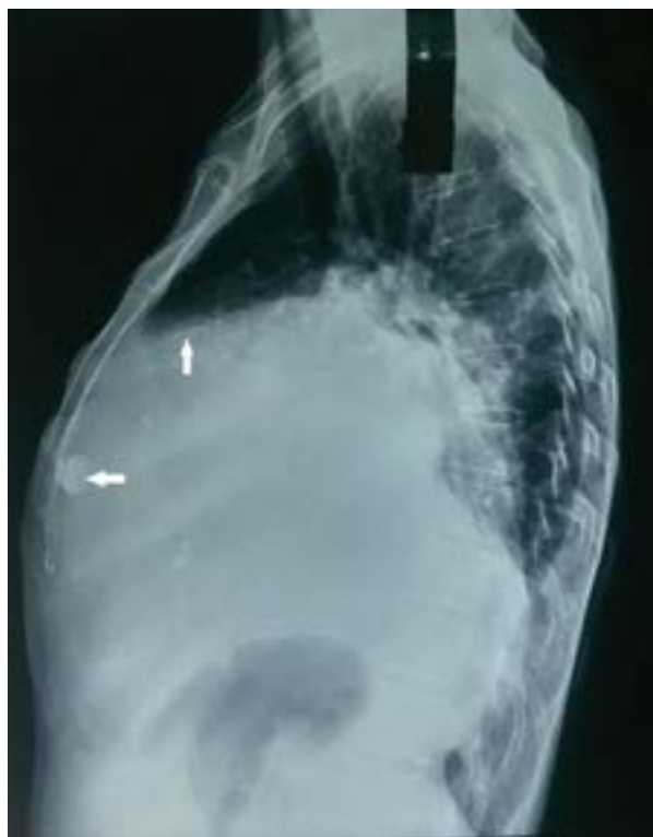
Figure 2. X-Ray chest lateral view showing pericardial calcification (arrows)

with hugely dilated right atrium disproportional to the degree of tricuspid regurgitation and pulmonary arterial hypertension. The pericardium was thickened (8 mm) with dilated inferior vena cava (IVC) (24 mm) with loss of respiratory variation of diameter.