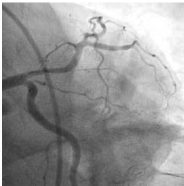
Figure 4. Anterior-posterior caudal view showing complete healing of dissection