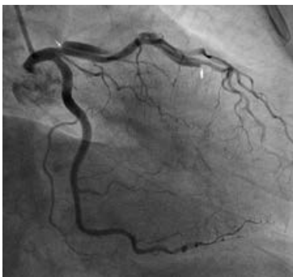
Figure 1. Right anterior oblique caudal view showing spiral dissection of proximal left anterior descending (LAD) artery (white arrow showing flap)

with the first injection and the position of the catheter tip was well away from the origin of the LAD. The rest of the patient coronary arteries were normal without any evidence of atherosclerosis or dissection. Urgent PTCA to LAD was planned and advised, but the patient refused any intervention and therefore was managed conservatively with guideline-directed medical therapy and discharged on fifth day in stable condition. After 4 weeks he again presented with unstable angina and was managed accordingly. Coronary angiography was performed using 6 F Judkins left and right catheters (Medtronic, Minneapolis, USA) through femoral route. There was the complete healing of the dissection (Figure 4). Echocardiography indicated normal LV systolic