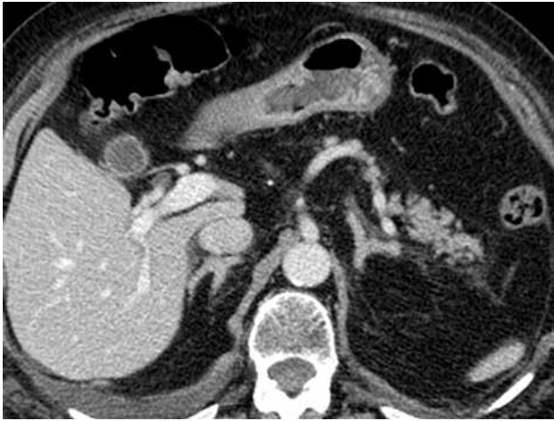
Figure 2. CT image demonstrates normal adrenal glands Rycina 2. W badaniu CT uwidoczniono prawidłowe nadnercza

were reduced. The last assessment, 26 months after the operations, revealed fluctuating very low/Low/normal cortisol levels, low-normal UFC, borderline 1 mg DST, and normal late-night saliva cortisol. These results may indicate remission with cyclic ACTH/cortisol secretion (Table I). The patient is in good shape on stress doses of hydrocortisone. She has started to travel and leads a normal, active social life. Because her life expectancy exceeds however the time of prognosed duration of remission with the presence of pituitary tumour remnants and intact left adrenal gland, the patient was qualified to pituitary radiosurgery with a Gamma Knife.