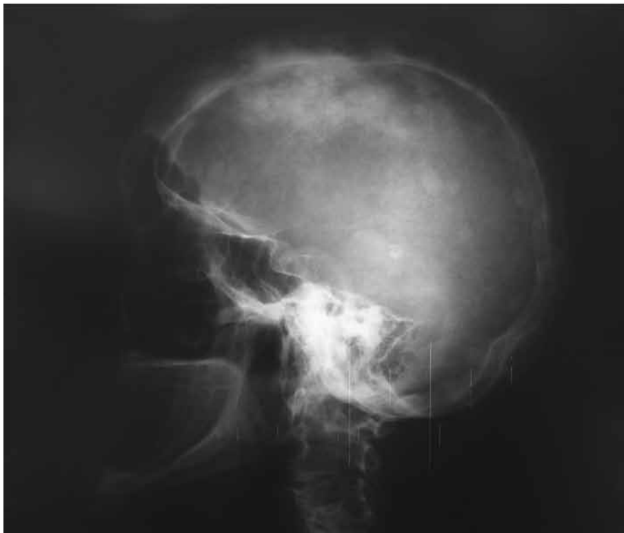
Figure 1A. Bone scintigraphy showing polyostotic Paget's disease of bone with enhanced tracer uptake more prominently on skull, pelvis and spine, and dispersed degenerative articular lesions before zoledronic acid infusion; B. Radiograph of the skull showing a 'cotton-wool' appearance indicative of the sclerotic phase of Paget's disease of bone

Rycina 1A. Scyntygrafia kości przed podaniem we wlewie kwasu zoledronowego: cechy polioostotycznej choroby Pageta ze zwiększonym wychwytem znacznika, zwłaszcza w kościach czaszki, miednicy i kręgosłupa, oraz rozsiane degeneracyjne zmiany stawowe; B. RTG czaszki: zmiany typu „kłębków waty” sugerujące sklerotyczną fazę choroby kości Pageta