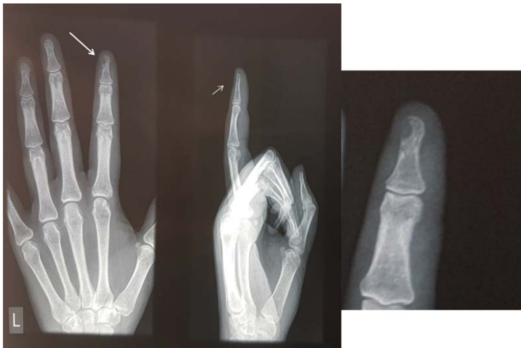
Figure 2. Plain radiographs were performed in anterior and lateral views. On anterior view scalloping of the medial aspect of distal phalanx of the left index finger was noticed (large white arrow). Lateral view radiograph showed thinning of the dorsal aspect of the phalanx (small white arrow). Enlarged radiographic image is presented on the right side of the figure