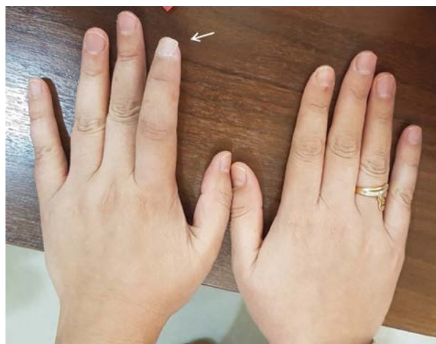
Figure 1. Patient's hand. Note the fusiform shape of the involved finger (arrow)

In general, glomus tumours are rare tumours which are composed of the modified smooth muscle cells [1]. These cells arise from neurovascular structures responsible for thermostasis and named as glomus body [1]. Glomus tumours occur more commonly in young adult, which account for 1–5% of soft tissue tumours [1–6].