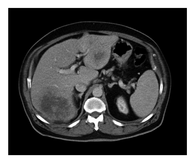
Figure 1. Baseline status before treatment — 04/01/2016. Tumours in the right and left liver lobe, examination in the venous phase after intravenous administration of iodine contrast medium

Computed tomography (CT) imaging of the chest, abdomen, and pelvis was performed in January 2016 (Fig. 1) — it revealed hypervascular tumours with a wash-out effect and central disintegration. There were two lesions identified: in segment 6 with transverse dimensions 120 \times 100 mm and in segments 2/3 with size 100 \times 82 mm. No metastases outside the liver were found. Clinical stage was defined as cT3aN0M0 (IIIA according to TNM, seventh edition).