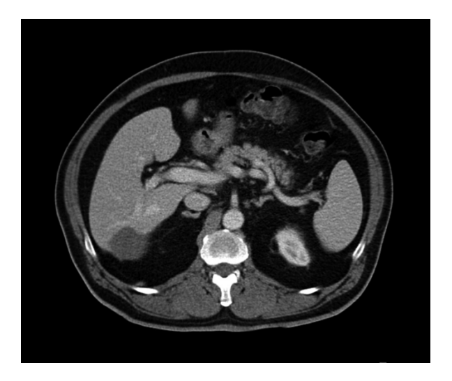
Figure 3. Status after sorafenib treatment—02/02/2017. Shrinkage of lesion in the right lobe, venous phase