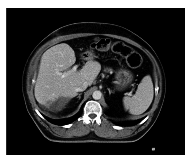
Figure 4. Status after resection of the lateral segments (2 and 3) of the left lobe together with the tumour and segment 6 — 23/06/2017