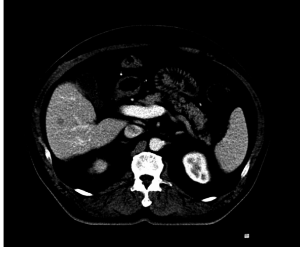
Figure 5. Status after surgery — 23/06/2017. The control shows the metastasis in the right lobe

remained within normal limits. The patient has reached over 12 months of disease-free survival (DFS). The use of sorafenib in the described case allowed us to conduct a radical procedure, and the treatment, assumed to be palliative, became a remission-inducing and enabling resection.