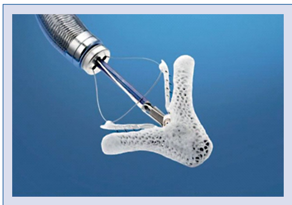
Figure 2. MitraClip — a system for percutaneous repair of mitral regurgitation. The MitraClip system is used for percutaneous repair of mitral valve mitigation of the beating heart as an alternative to conventional cardiac surgery. The procedure is performed in a suitably adapted hemodynamic laboratory using transesophageal echocardiography and fluoroscopy [21]. The MitraClip system consists of an implant, an introductory catheter and an implant placement system that enables it to be placed on the mitral valve leaflet, causing it to be permanently approached, and a double-mitral valve is formed, thereby preventing blood from regressing. MitraClip is introduced into the mitral valve outlet via the venous system (femoral vein, inferior vena cava and then, after puncturing the atrial septum, to the left atrium) without opening the chest.

million people suffering from MR in the United States, and this number will double by 2030 due to an increase in size of the aging population [21]. The treatment of isolated mitral leaflet repair using the ‘edge-to-edge’ method was introduced in 1991 by Alfieri to repair prolapse of the anterior mitral leaflet [22]. The operation consists of sewing both mitral leaflets in the central part in order to increase contact of the anterior and posterior leaflets, which leads to a reduction of regurgitation. This technique is also useful in the loss of the posterior or both leaflets. A double orifice mitral valve, which is obtained through this procedure, does not usually cause narrowing of the mitral outlet, even in combination with annuloplasty, and, as a result, its surface area is reduced. This is the basis for the method of percutaneous treatment of MR (MitraClip) (Fig. 2) [21].