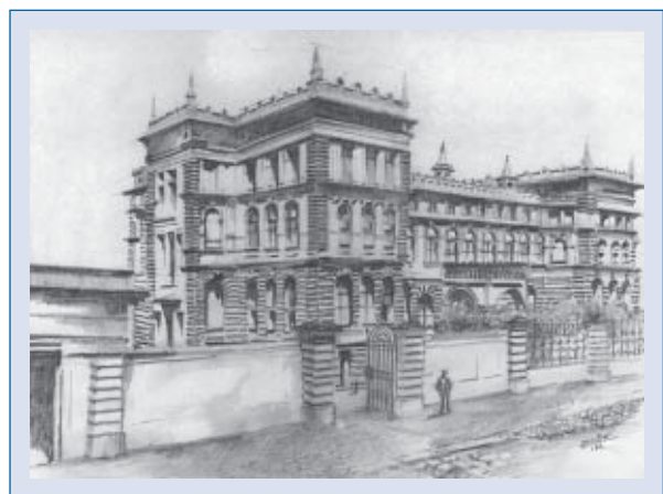
Figure 2. Dr Seweryn Sterling Memorial Hospital according to the photograph taken in 1896. A pencil drawing by Tadeusz Majda.