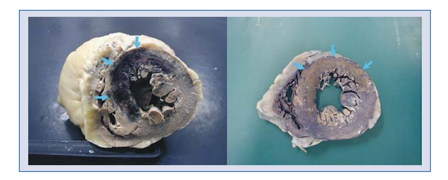
Figure 2. Photograph of horizontal section of the heart; A. Gross hemorrhage occupies a large part of the region of distribution of the anterior descending coronary artery (arrows); B. Macroscopic NTB staining showing extensive transmural hemorrhagic infarction of the antero-septal myocardium with consequential thickening (arrows).