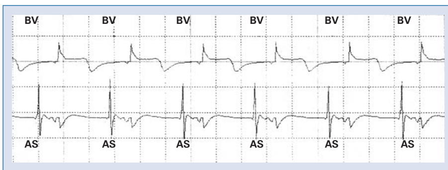
Figure 2. Electrograms showing sensed A waves (AS) followed by normal biventricular pacing.

sensed as a refractory event (AR). The next ventricular paced is withheld, resulting in a sensed ventricle with native PR. This proves that for most of the day the patient alternated ventricular pacing and sensed QRS, in spite of the fact that the programmed sensed AV is 100 ms [2].