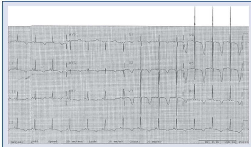
Figure 1. Admission electrocardiogram demonstrating QTc interval of 826 ms.