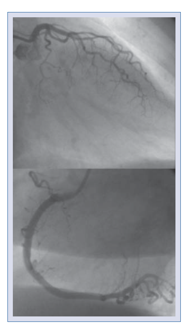
Figure 1. No significant lesions in coronary arteries.

mal left ventricular ejection fraction (LVEF) of 60%. The patient has been treated in our hospital in 1999 due to sudden onset of chest pain related to emotional stress before a tonsillectomy procedure. In echocardiography, ejection fraction reduced to 25% with typical hypo-kinesis of apical segments, and dilation of left ventricular up to 150 mL was then observed. Control examination after ten days showed augmentation of ejection fraction up to 60% with total regression of contractility disturbances (Figs. 2, 3).