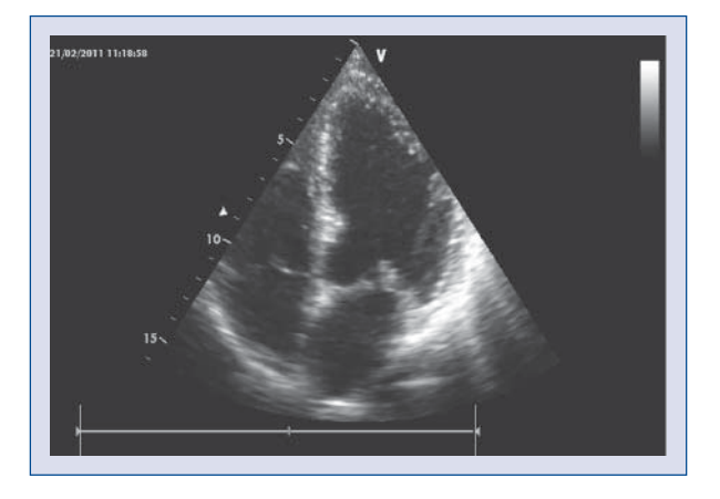
Figure 3. Normal left ventricle contractility three days after symptoms onset.

disturbances with a LVEF of 40% were observed. Serum levels of CK-MB were 91 IU/L (N < 25.0 IU/L) and troponin I was 1,639 ng/L (N < 14 ng/L). In the coronary angiography, no relevant coronary artery stenosis was diagnosed. After ten days, LVEF had increased to 50%. It is worth noting that the same patient had been examined due to stable angina (including coronary angiography with no relevant stenosis and proper echocardiographic examination) six months before the NSTE-ACS occurred.