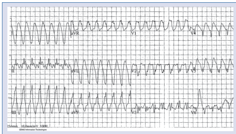
Figure 1. ECG when patient presented dizziness and palpitations with ventricular tachycardia.

posterior wall thickness of 16 mm, and a left ventricular ejection fraction of 62%. There was neither mitral valve systolic anterior motion, nor left ventricular outflow tract obstruction. At that time, she had non-sustained VT on a 24-hour ambulatory ECG recording, before any beta-blocker treatment was initiated.