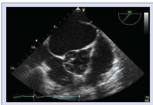
Figure 3. Two-dimensional transesophageal short-axis view of the aortic valve; AC — accessory cusp; LCC — left coronary cusp; NCC — non-coronary cusp; RCC — right coronary cusp.