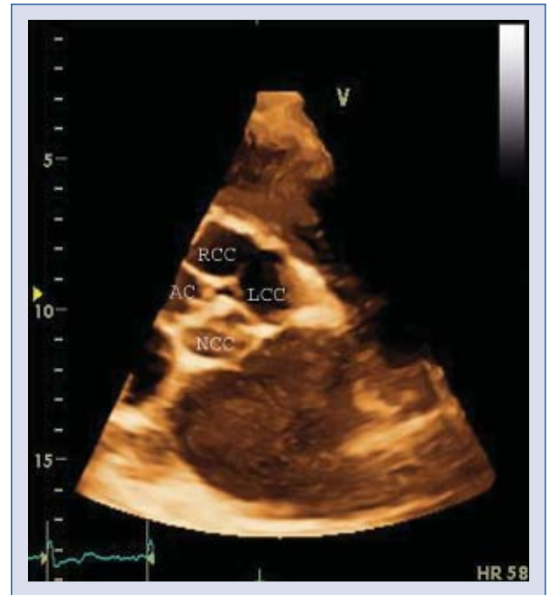
Figure 4. Three-dimensional transthoracic short-axis view of the aortic valve; AC — accessory cusp; LCC — left coronary cusp; NCC — non-coronary cusp; RCC — right coronary cusp.

malinity was found. The coronary angiogram was normal. In the present case, surgical treatment was considered, but the patient refused. Medical treatment was initiated.