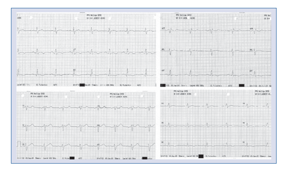
Figure 1. Electrocardiography showing T-wave inversions in II, III, aVF and V5, V6.