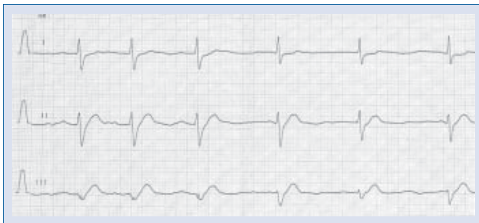
Figure 1. Sinus bradycardia (PQ 280–360 ms, QRS complexes 200–220 ms), transient sinus arrest or atrioventricular block 2:1. Atrioventricular junctional rhythm 43 bpm. Periodic isorhythmic dissociation.