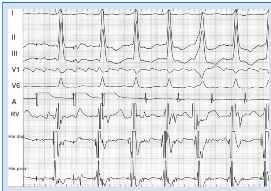
Figure 2. Tachycardia induction using double atrial extrastimuli: S_1S_1 = 500 ms, S_1S_2 = 350 ms, S_2S_3 = 270 ms. The key aspect of this tracing is that the HV interval and the degree of pre-excitation remained constant, despite four different AH intervals, strongly suggestive of bystander fasciculoventricular AP.