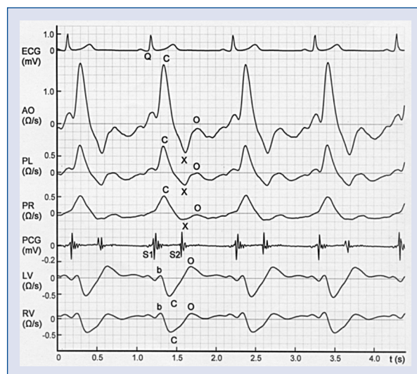
Figure 2. Differential graphs of impedance change components. Lines 2, 3, 4, 6, and 7 are the differential graphs of the aorta (AO), blood vessel in left lung (PL), blood vessel in right lung (PR), left ventricle (LV) and right ventricle (RV), respectively. Symbol C is the peak point of the C wave in the systolic phase. X is the negative peak point of the X wave of the AO, PL, and PR. b is the peak point of the b wave of the LV and RV in the initial systolic stage. O is the peak point of the O wave in the initial diastolic phase. The meanings of Q, S1, S2, \Omega/s and mV symbols are the same as in Figure 2.

Now that the O waves of various impedance change components (AO, PL, PR, LV, and RV) can be obtained from the mixed impedance changes measured on the chest surface through separation, the O wave of the thoracic impedance graph can be