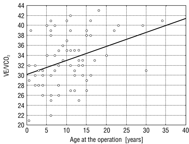
Figure 2. Correlation between age at surgical repair and ventilatory equivalent for carbon dioxide: VE/VCO_2 ( r = 0.335 , p = 0.005 )