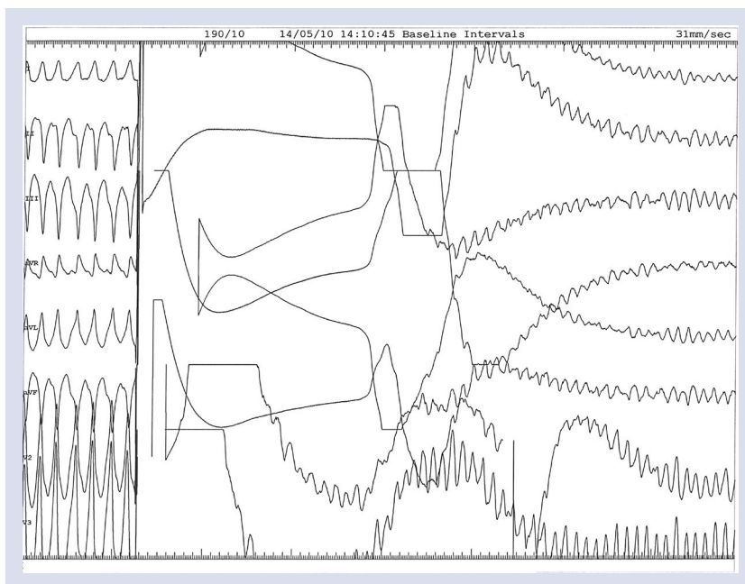
Figure 1. Inadvertently induced ventricular fibrillation by non-synchronized cardioversion of atrial fibrillation conducted by the accessory pathway.

pre-excitation are at risk of sudden cardiac death (SCD). The generally accepted mechanism for SCD in Wolff-Parkinson-White syndrome (WPW) is the fast conduction of AF to the ventricles over an AP with subsequent degeneration into ventricular fibrillation (VF) [9–11]. The current guidelines recommend radiofrequency catheter ablation (RFCA) as the first line therapy in patients having AF and WPW [12–14].