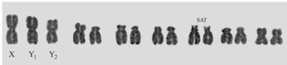
Fig. 1. Chromosome complement of male Rumex acetosa 2n = 12 + XY_1Y_2 with sex chromosomes indicated.

and tissues, and frequently form heteropycnotic bodies in somatic tissues, but only rarely in root-tip meristems [22, 30, 41]. Second, the results of DNase sensitivity assays on root-tip cell Y chromosomes are similar to those of Rumex autosomes [9]. These studies suggest that Y chromosomes are probably transcriptionally active, at least in meristematic cells, where heterochromatinization is not generally observed.