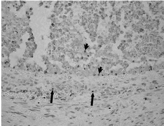
Fig. 2. A fragment of the ovarian follicle from day 90 of pregnancy with positive TUNEL staining both in granulosa (arrowhead) and in theca cells (arrow). \times 400 .

thin ring around the oocyte (Fig. 1A). Adjacent section of the same follicle clearly showed that almost all cells forming that follicle were negative for AR. Similar pattern was observed in atretic follicles isolated from ovaries collected on other studied days of pregnancy. In follicles showing advanced stages of atresia many apoptotic granulosa cells were detached and released into the follicular antrum (Fig. 2). Moreover, many apoptotic cells were scattered in the theca interna layer. On the other hand, in the ovary obtained on day 90 of pregnancy, many follicles looked normal by morphological criteria, and their cells were negative in TUNEL staining. These follicles expressed very high level of AR in granulosa cells and in some theca cells.