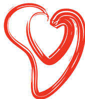
SA Heart Association