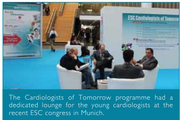
The Cardiologists of Tomorrow programme had a dedicated lounge for the young cardiologists at the recent ESC congress in Munich.