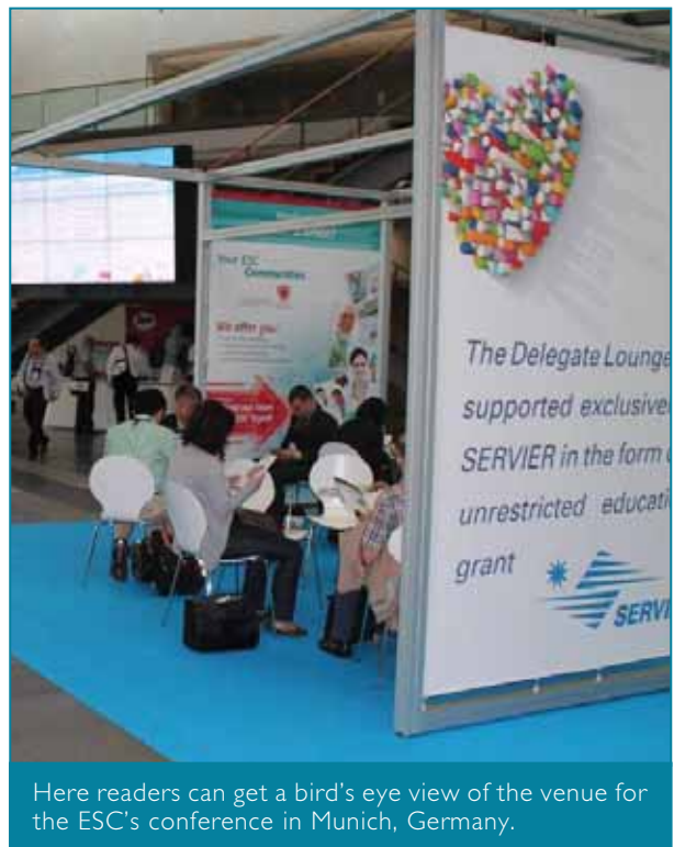
Here readers can get a bird's eye view of the venue for the ESC's conference in Munich, Germany.