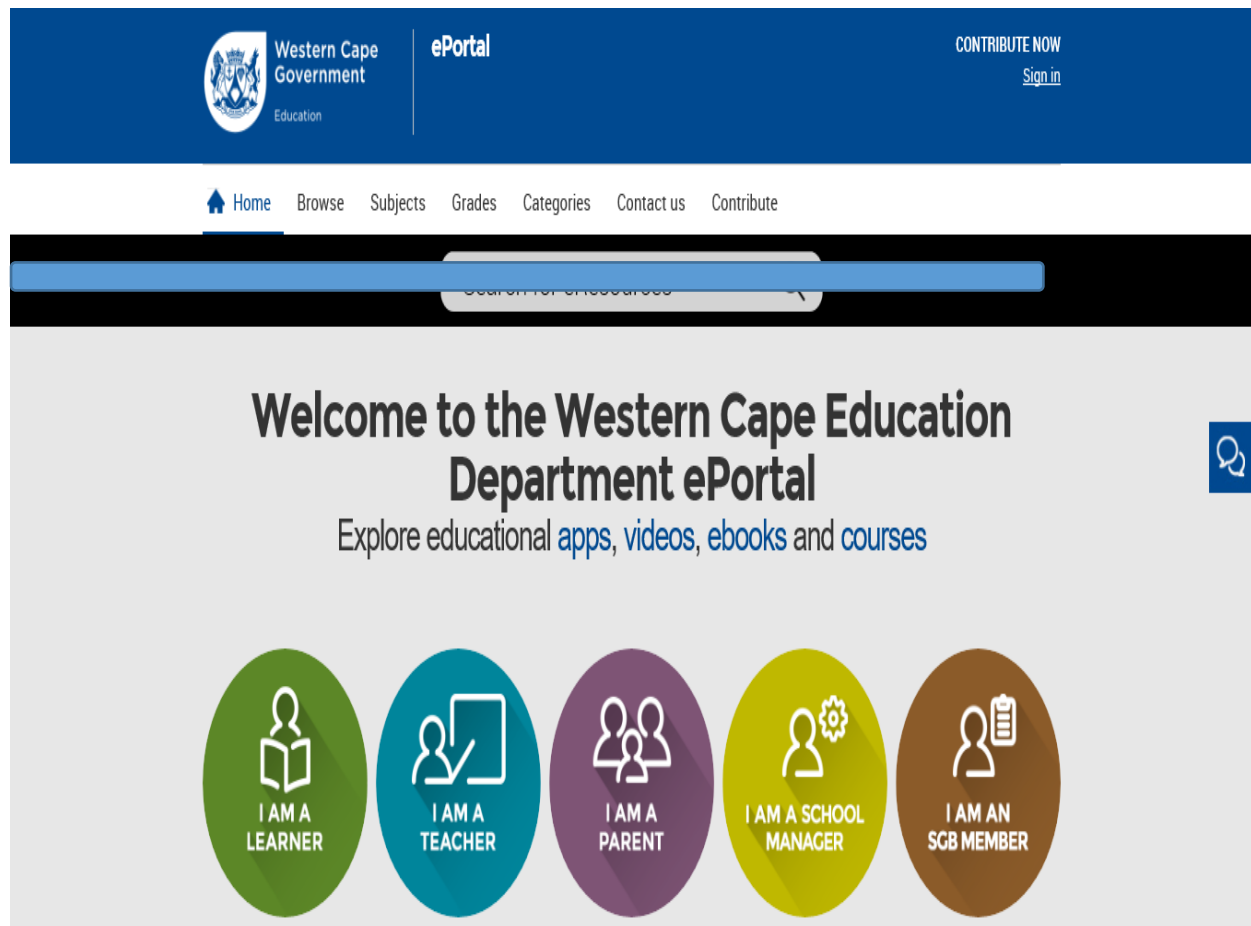
Figure 2: Western Cape Education Department e-Portal (WCED 2016)