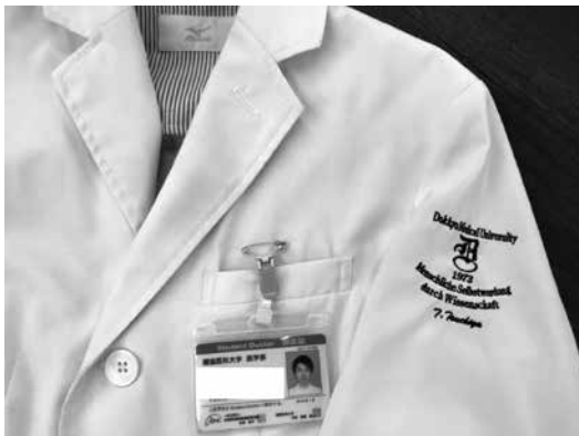
Figure 1 An SD badge and the 2018 version of the white coat