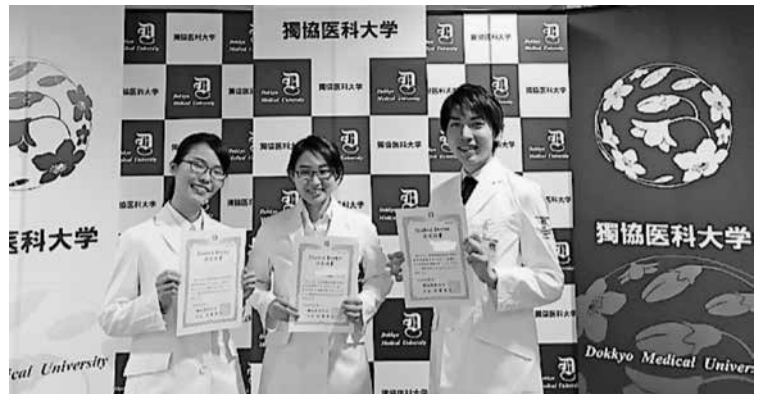
Figure 2 Students holding SD certificates after the SD ceremony (February 2nd, 2018)

procedures under the supervision of medical advisors during their clinical clerkship prior to obtaining their medical licenses, this period of their professional development holds significant meaning for Japanese medical students. For this reason, the SD ceremony in Japan is often combined with a white coat ceremony because it is regarded as the best time for students to reflect on becoming part of the medical profession 5,6 .