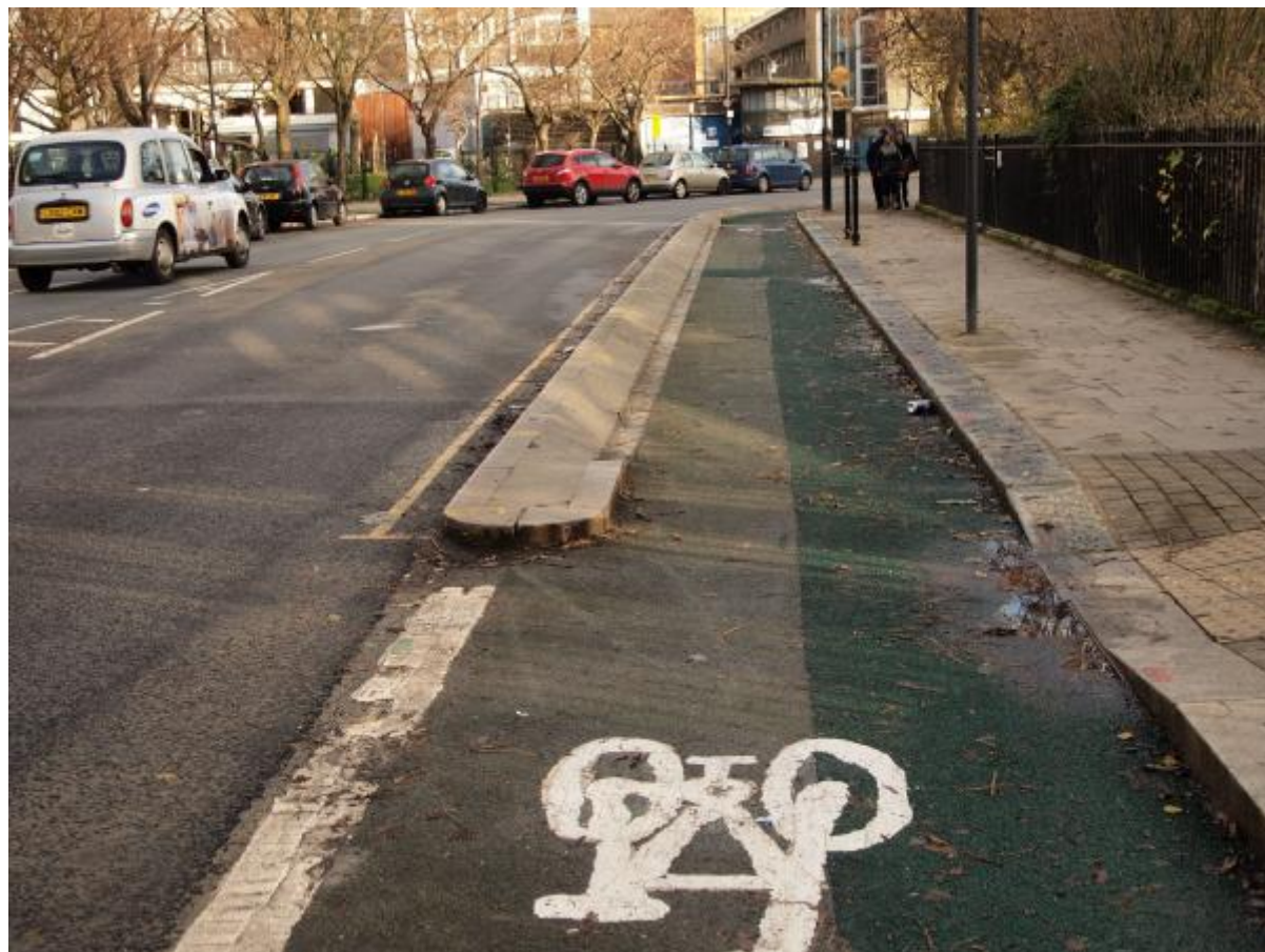
Figure Apx.5. Kerb Segregation