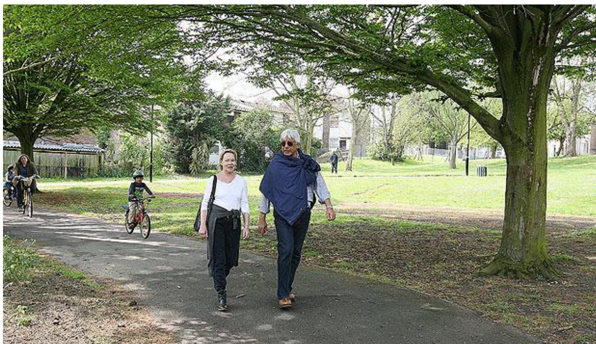
Figure Apx.10. Shared Park Route