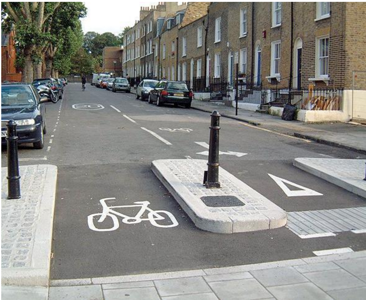
Figure Apx.4. Filtered street