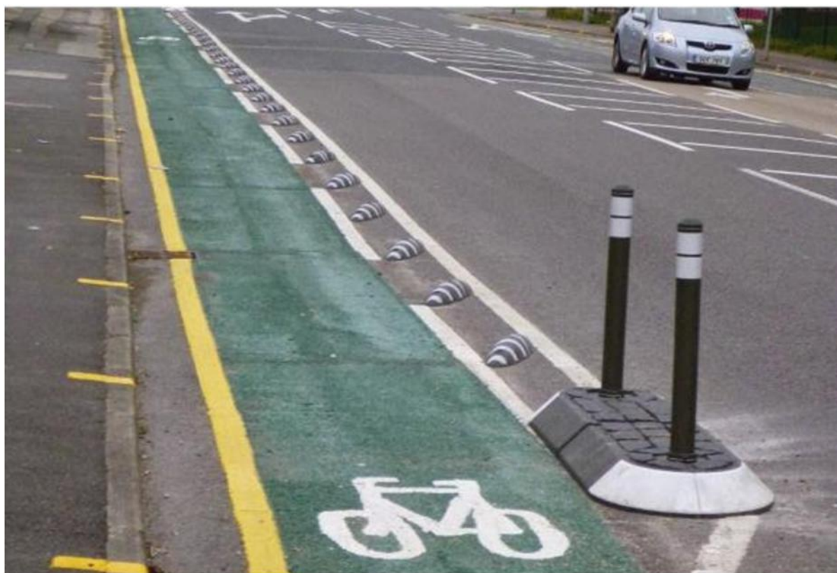
Figure Apx.1. Armadillo Segregation Only