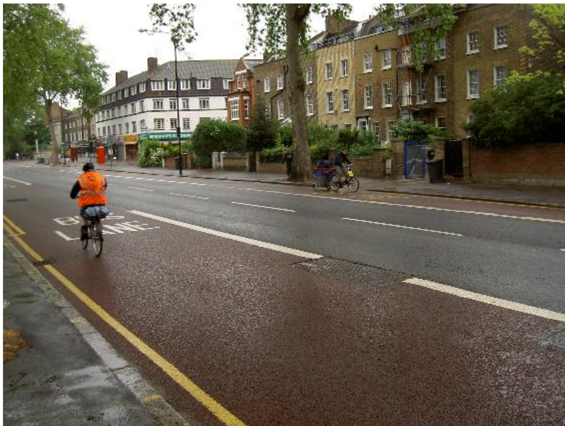
Figure Apx.9. Shared Bus and Cycle Lane