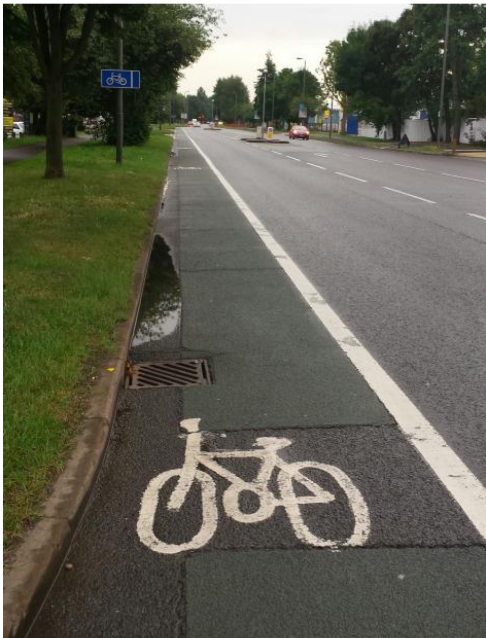
Figure Apx.6. Mandatory Cycle Lane