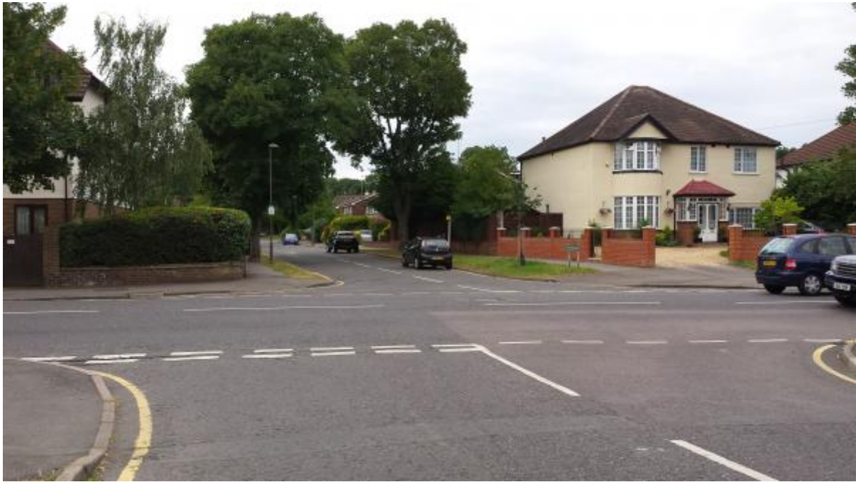
Figure Apx.3. Cross Busy Road