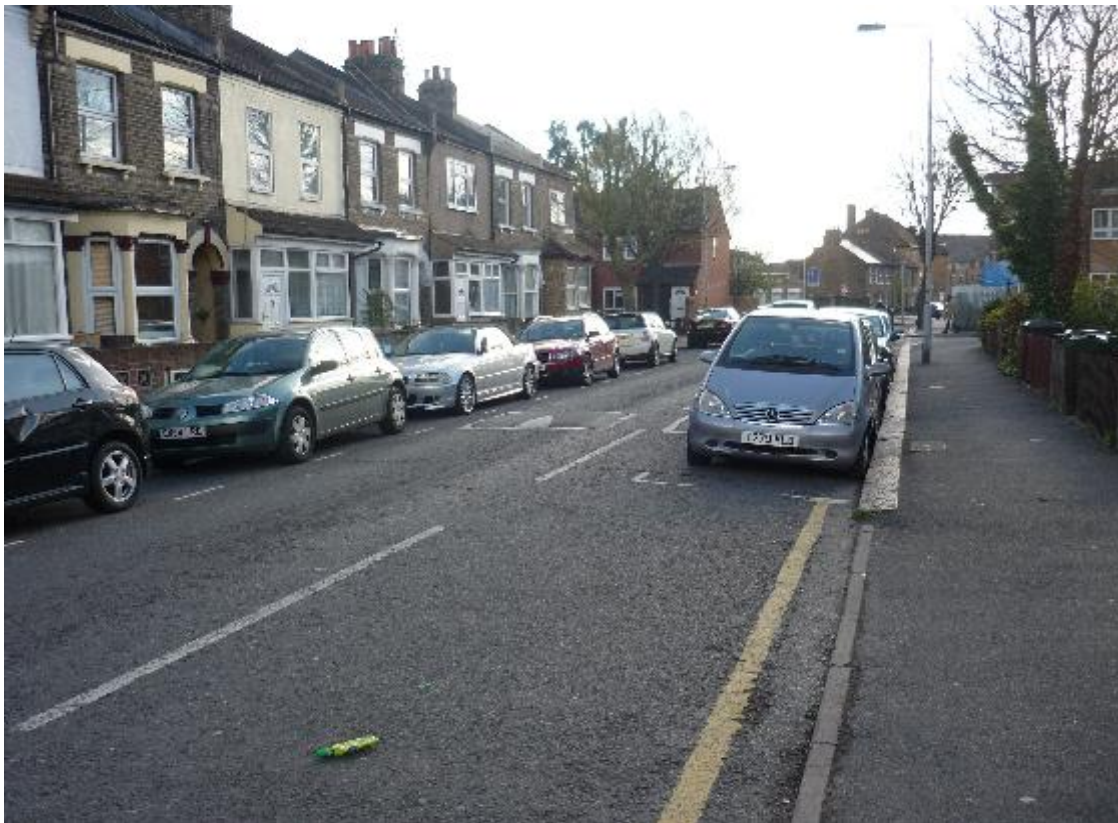
Figure Apx.8. Residential Rat Run