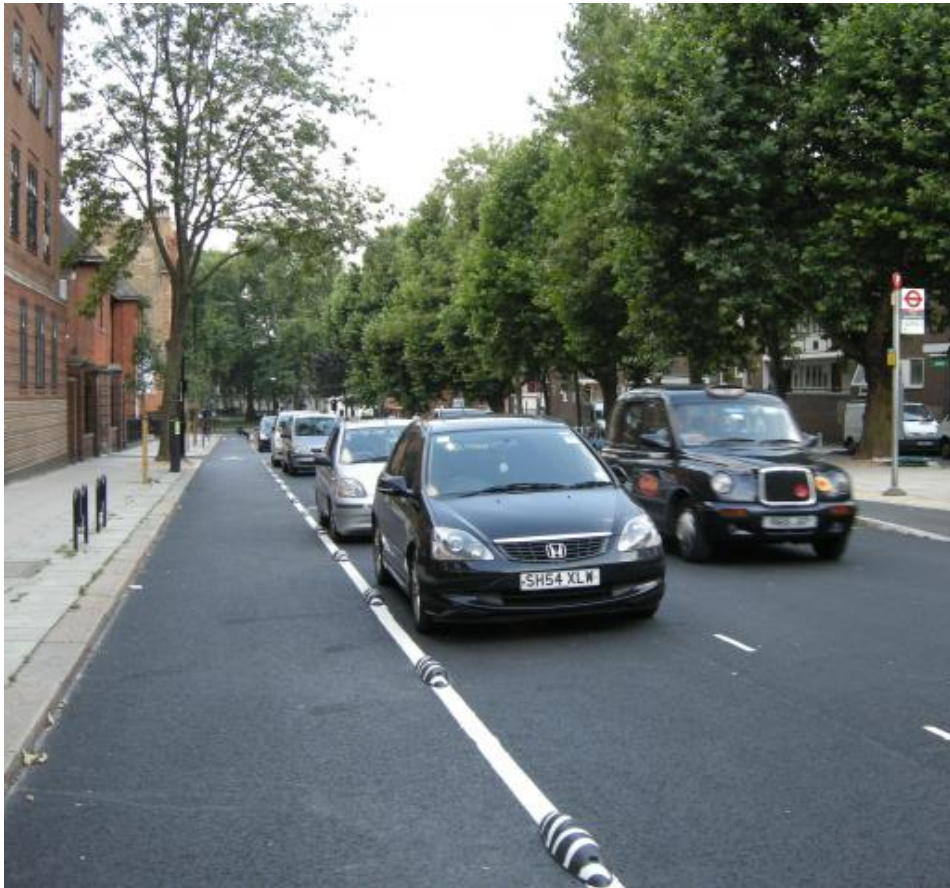
Figure Apx.7. Parking Segregated