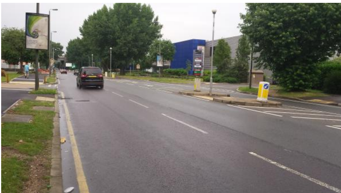
Figure Apx.2. Busy Road