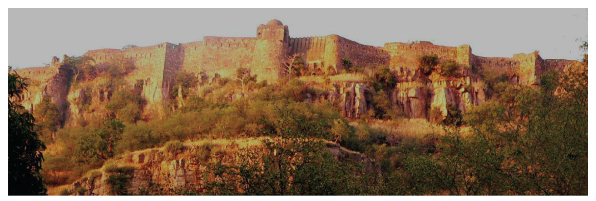
Figure 2: Jana Urban Space Foundation. View of heritage listed Ranthambore Fort from inside the Ranthambore National Park [Bangalore: 2016]

from further development, and in doing so support the continuing growth of tourism industry in the city and its surrounds.