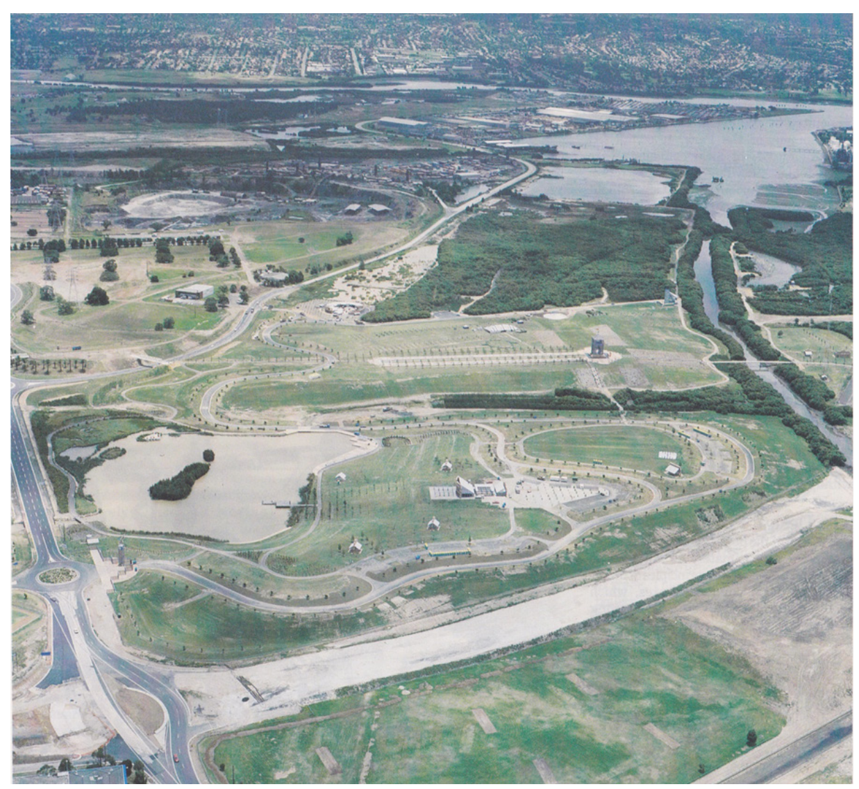
FIGURE 4 Aerial photograph of Bicentennial Park, looking north to Homebush Bay, 1987. This image shows the internal contrast of constructed and natural landscape, and the strong axes used to infuse the park with traditional design devices.

The manner in which ecological knowledge and expertise was interpreted and applied to reshaping of degraded sites was a key factor with the systematic documentation of regional ecology provided by the Sydney RBG vegetation surveys especially critical. The maps readily communicated extensive habitat fragmentation across the Sydney region; which in turn reflected urban degradation, and this implied narrative of civic declension