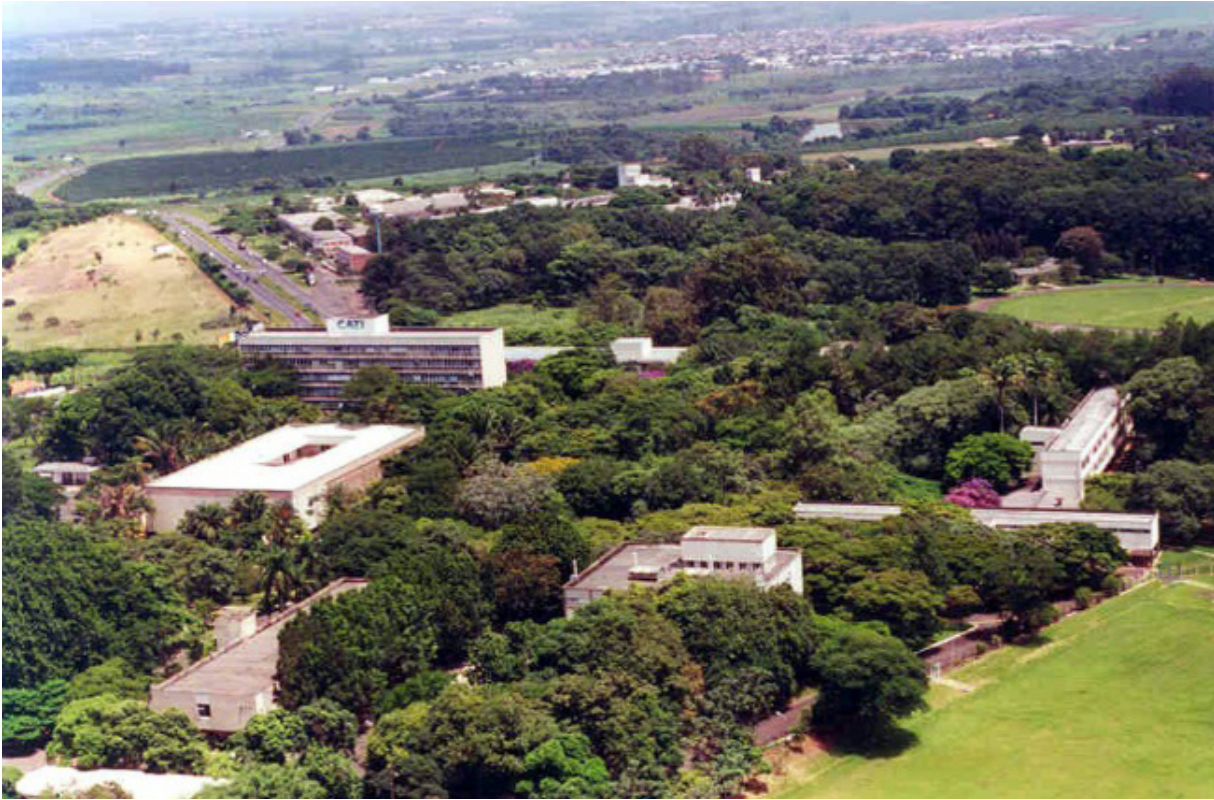
FIGURE 4 CATI Complex (Coordination of Integral Technical Assistance, former Agronomic Training Center) (foreground) and ITAL (Institute of Food Technology, former Tropical Center for Research and Technology of Food) at Fazenda Santa Eliza, Campinas, SP. Partial panoramic view.

While the Action Plan foresees the creation of FAPESP – Fund for Scientific and Technological Research of São Paulo State –, the controversial Agrarian Review is not included in it, although it is a central political platform of Carvalho Pinto’s government. Its absence certainly results from its polemical character. Again, such initiative reveals more than the buildings, the political orientation of the Action Plan. The agrarian question – concerning the promotion of access to land – remains untouched in JK’s government, and is faced by Carvalho Pinto in a liberal way, just establishing “stimulus norms of rural property rational and economic exploitation”.