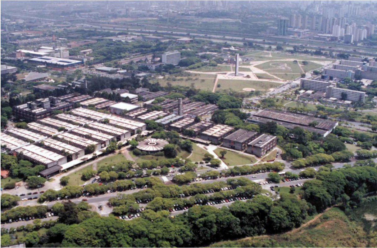
FIGURE 3 University Campus Armando de Salles Oliveira, São Paulo, SP. Partial panoramic view.

The Action Plan allocates the financial resources destined for agricultural and industrial expansion evenly; only the industrial financing funds are not implemented in face of the inflationary scenario of 1960 onwards. It foresees the installation of a network of agricultural development that covers almost all municipalities in a four year period, consisting of more than 308 “crop houses”, 29 agricultural regional offices, 16 heads of agricultural extension and 25 schools of agricultural initiation, all of them built by Ipesp – Institute of Social Security of São Paulo State. The Secretary of Agriculture builds seeds stations, mechanization stations and increases the capacity of warehouses and silos in 150% 17 . The CEASA – State Center for Supply S.A. – is created and the Capital Supply Center is built in those years.