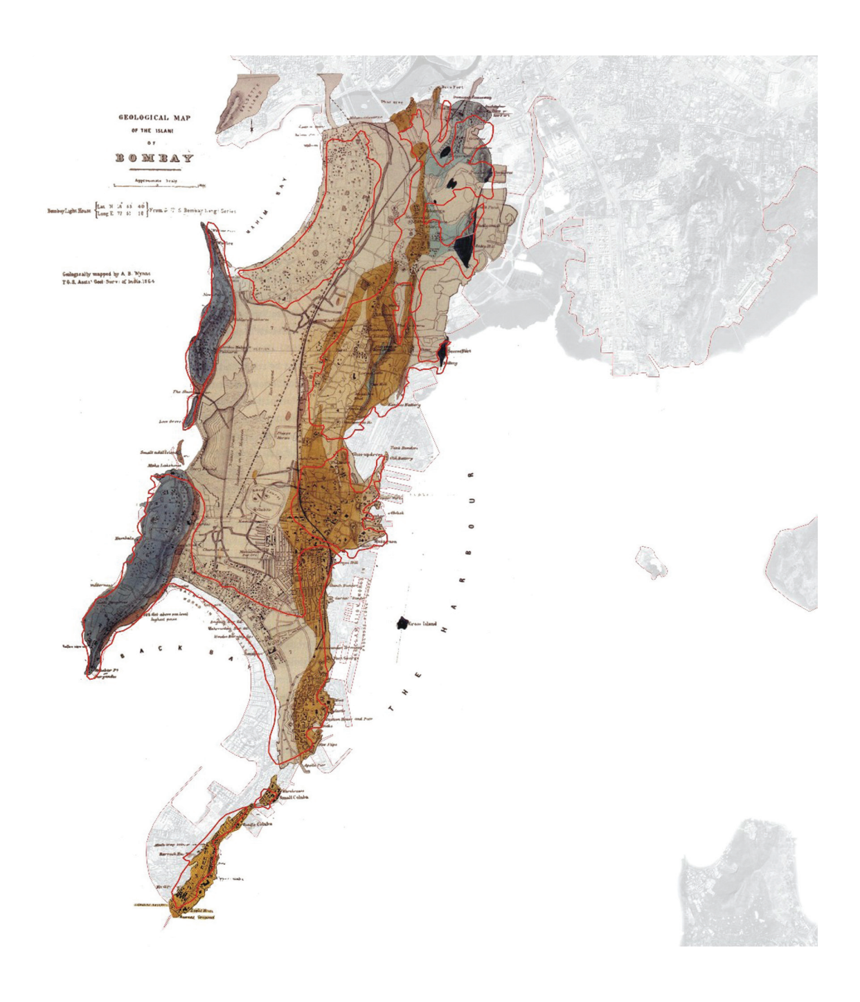
Fig. 1: Geological Map of the Island of Bombay, 1864.