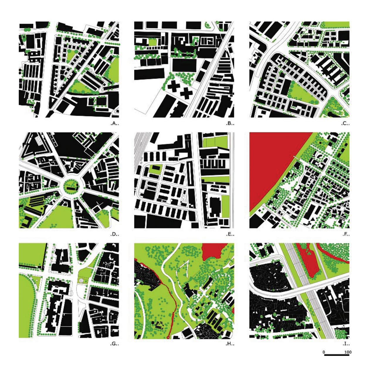
Fig. 4: Vegetation maps of nine areas in Mumbai.