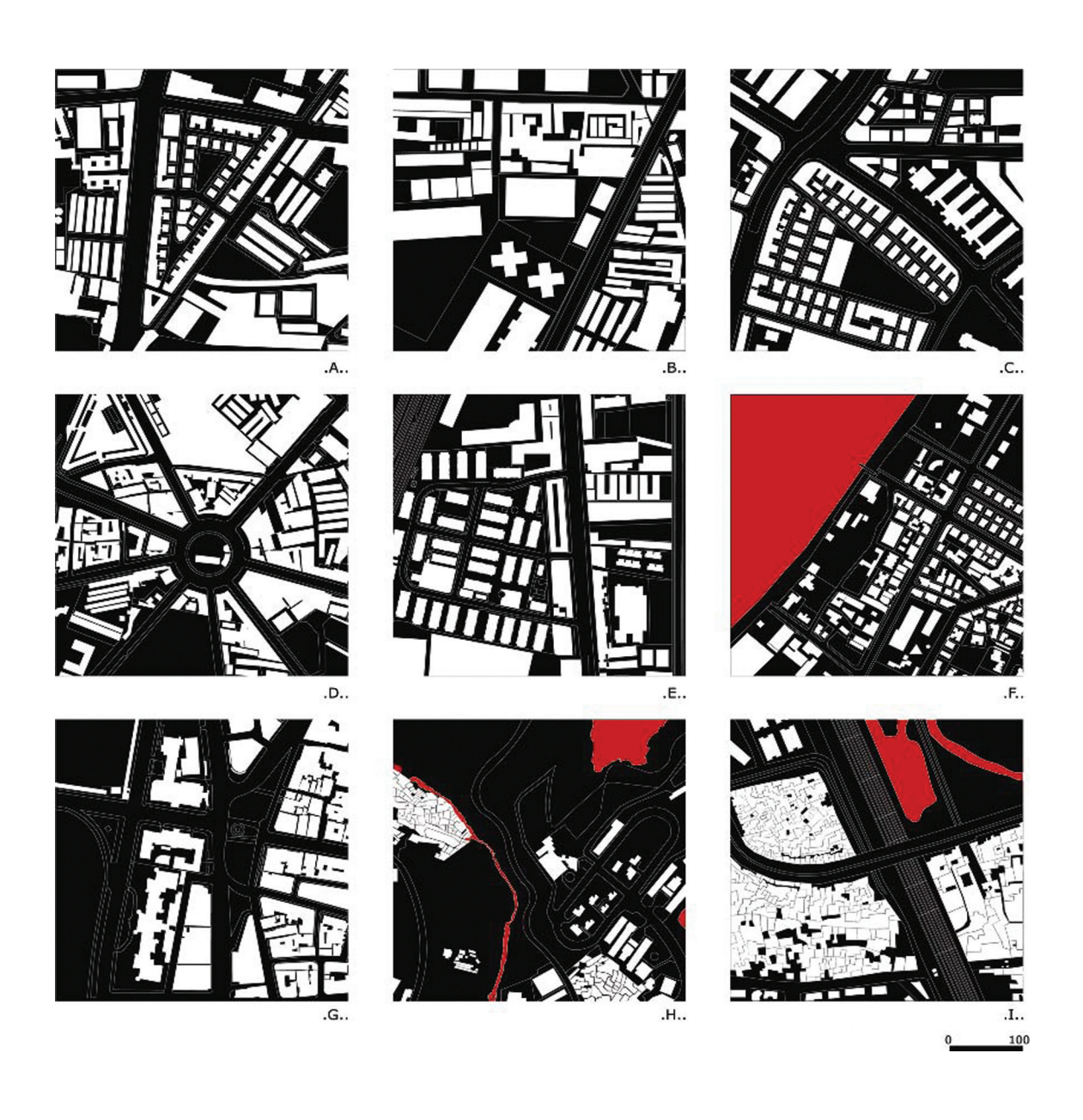
Fig. 3: Fabric analysis in Mumbai.