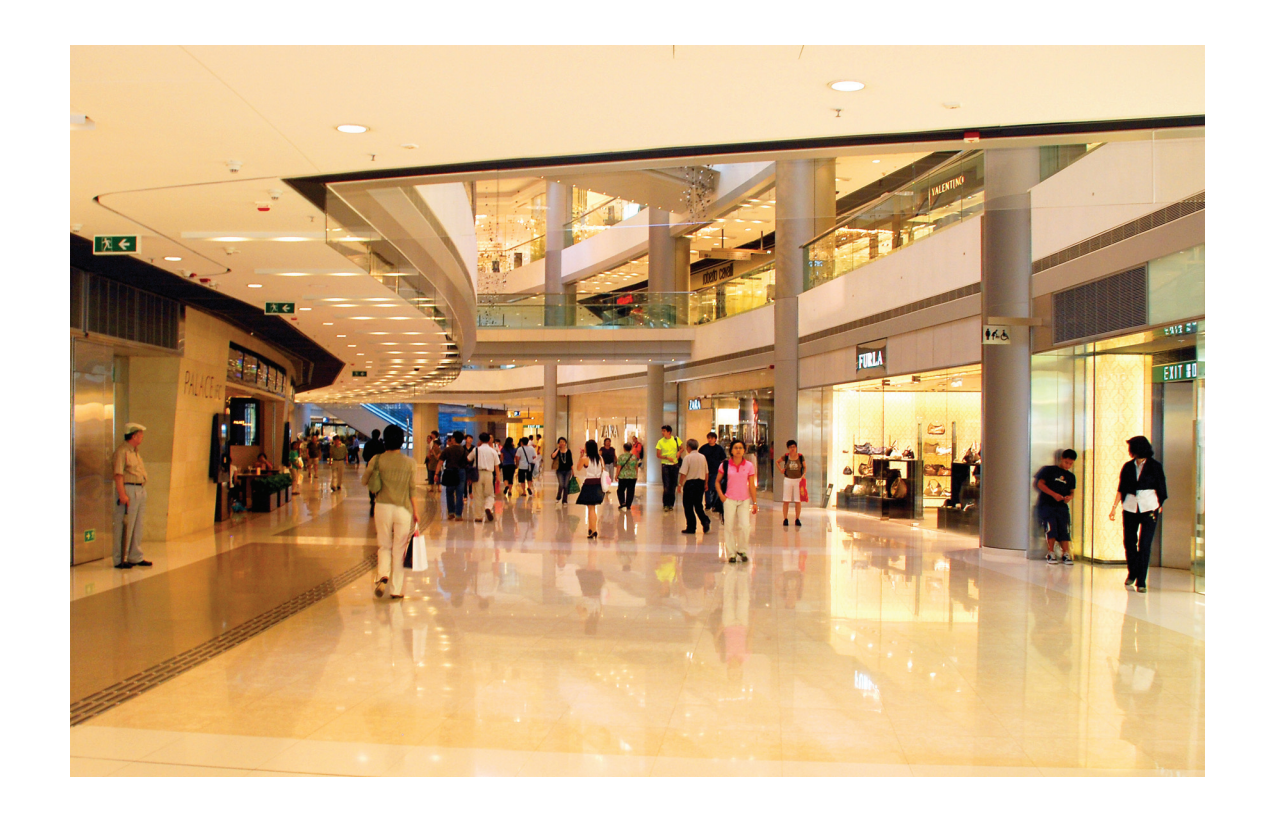
Fig. 2: 'Caves of Steel'; the International Financial Center Mall, Central, Hong Kong.