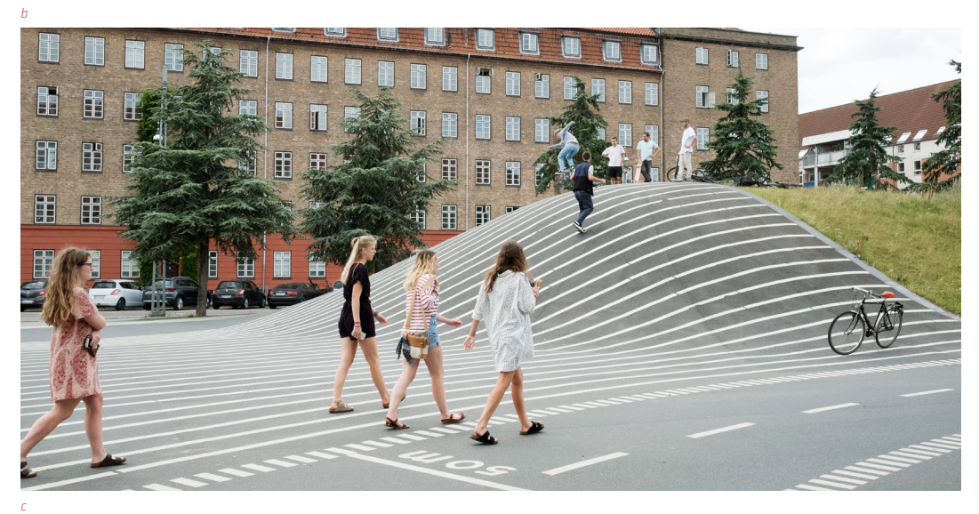
FIGURE 4 The features of Superkilen function as an arena for expressing your image of yourself: It is a great place to not only do sports but also to be seen being sporty.