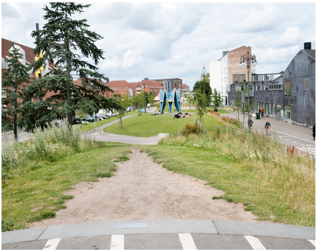
FIGURE 2 The urban area near Superkilen is dominated by housing and lots of it. Coming to these vistas feels like coming from the forest to the river bed, where the sky is finally visible.