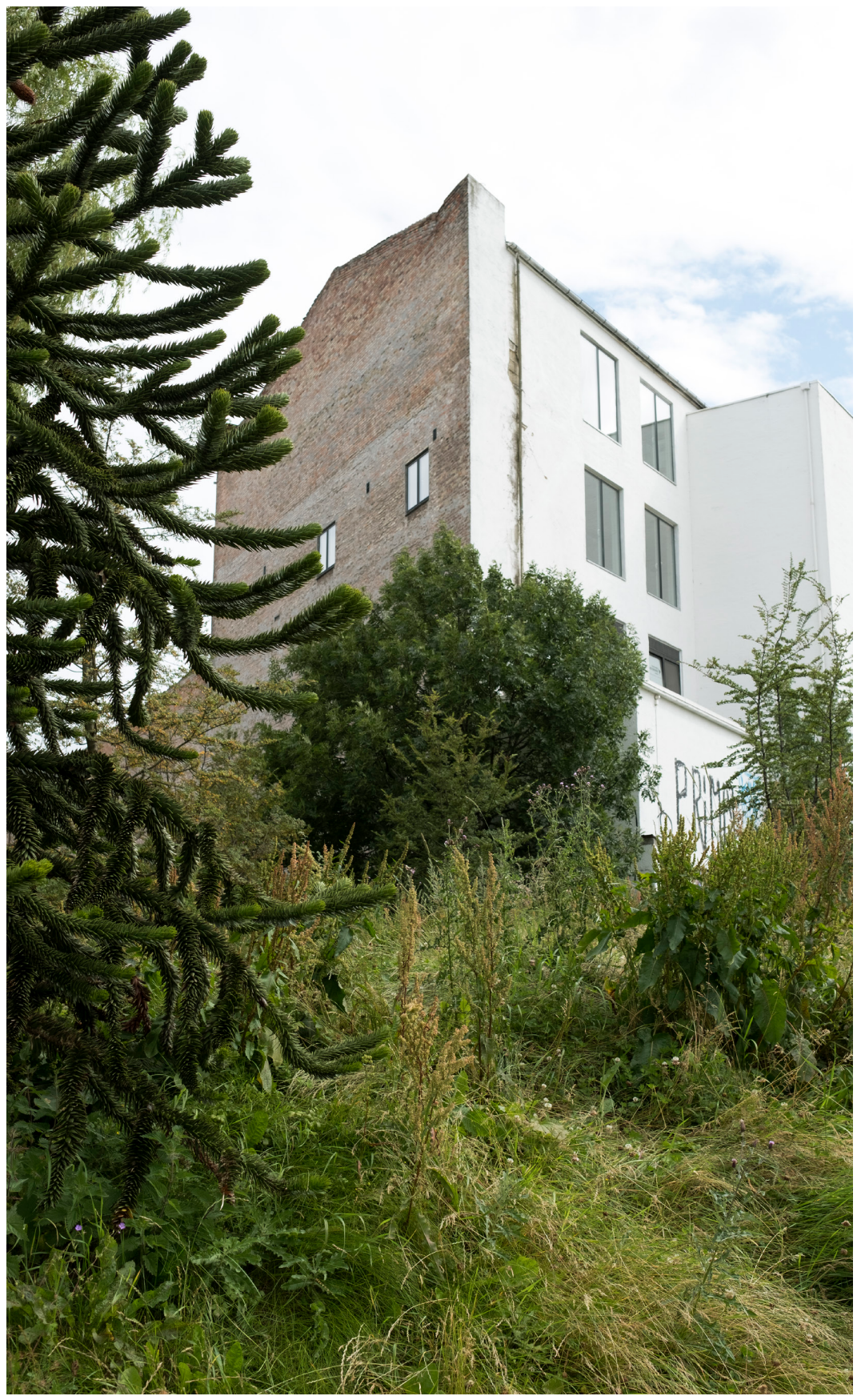
FIGURE 3 This very green image of Superkilen changes the perspective in scale as it provides a different experience.