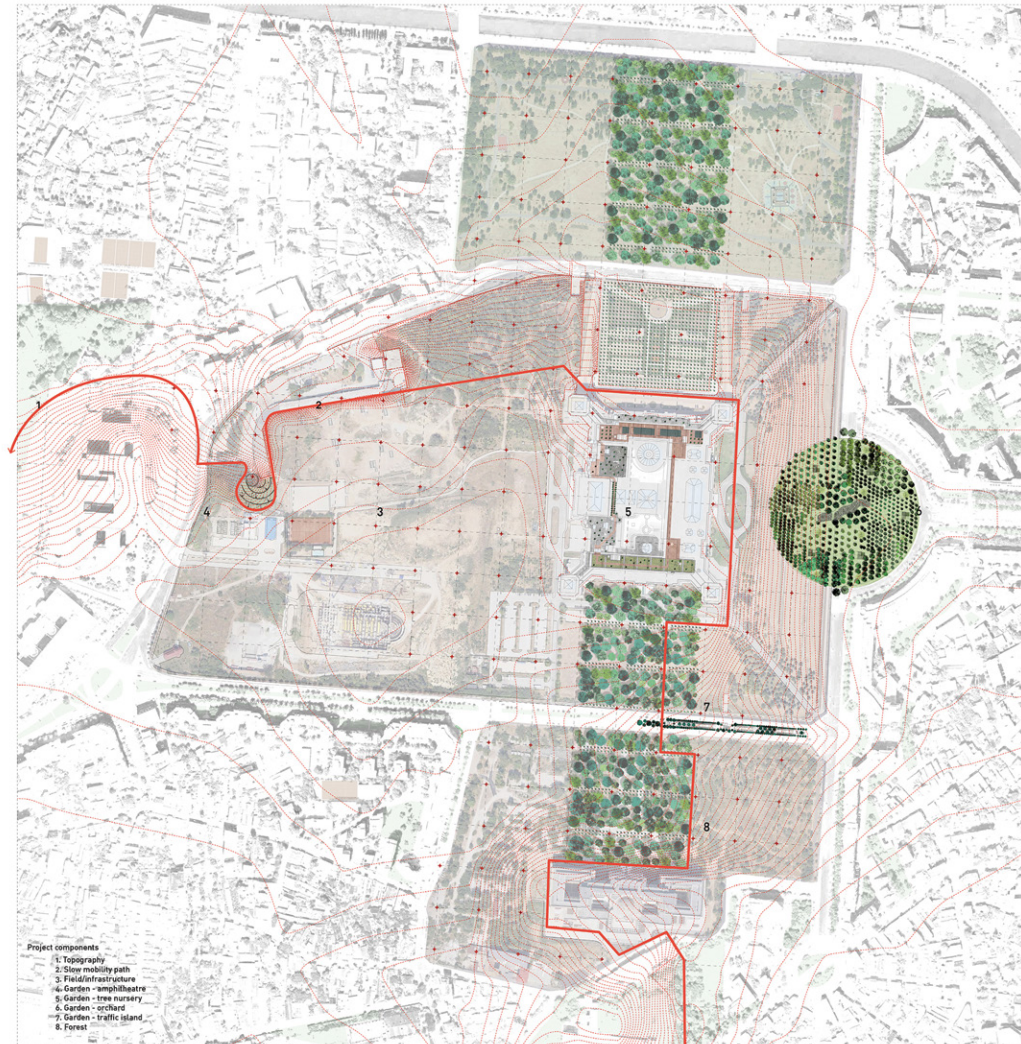
FIGURE 3 Site plan, Frame-of-frames. In its current configuration, the site framing is determined by the wall, which resonates as spatial delimitation both with the massive Palace of the Parliament, and with the residential blocks that outline the site's extents. This is further reinforced spatially by the three differing field conditions: Izvor park, to the north, the land enclosed by the wall in the centre, and an overgrown, but unfenced, field to the south, that unfolds in front of an (unfinished), large structure meant to be the 'House of the Academy'. Informed by the mapping of the site through its frames (Fig. 2), the current configuration of the site also has a number of quasi-frames - frames that once structured the site, but no longer hold prominence - such as the topographical ridge. In the speculative design project 'Frame-of-frames', the ridge is chosen as the frame from which to structure all other frames of the site, and its inflections become key components in this operation. For each of the inflections, a number of practices from the surrounding area are transposed onto the site. An infrastructure dealing with the height differences is introduced on the site, and new frames are set in place through the insertion of specific design interventions that function both as germs and gesture. These range across scales, and involve four 'gardens' that directly frame the ridge's inflections and activate them programmatically: a slow mobility path partially following the site of the wall, which links these gardens; an infrastructural grid that spans across all three fields, incorporating their territory into the site; and a wooded band that absorbs the building into a larger spatial logic, removing its prominence in structuring the site. To recall the mechanisms of framing outlined in the research, each framing component of the site—gardens, infrastructure, path, and forest—each takes on different roles in framing and reframing the site that vary across scales. For example, at the small scale, the topography is the inflection framed by the garden, while at the large scale the topography is what frames the larger site, and beyond that the topography is the vector that connects the continuous landscape at the scale of the territory. doi:10.7480/spool.2016.1.1135.g1499