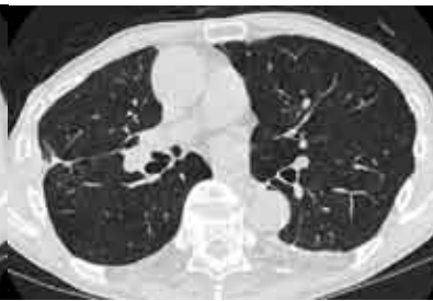
B: after first gefitinib