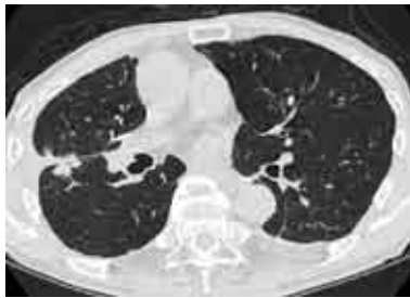
A: before first gefitinib