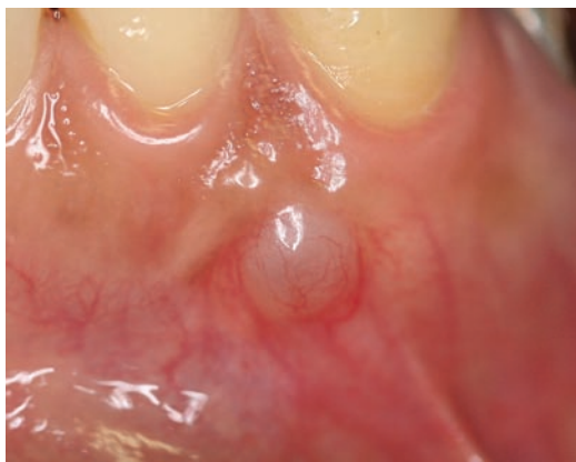
Fig. 1. Secondarily-developed mass in the left mandible.

The lesion was excised with covering gingiva and periosteum under local anesthesia. A small cup-shaped pressure resorption of underlying cortical bone was present. The excised region was covered with a small mucoperiosteal flap. The surgical site healed uneventfully with no recurrence at an eight-