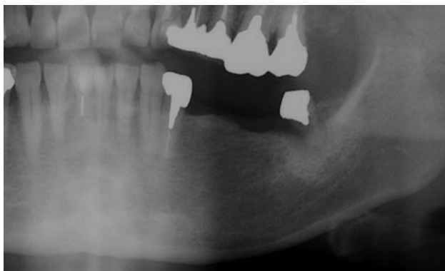
Fig. 2. Panoramic views of the left mandible.