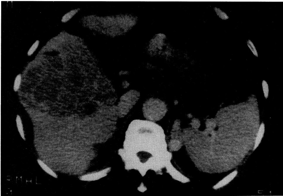
Fig. 1. X ray-CT shows liver cancer and liver cirrhosis

and CT (Fig. 1) disclosed a large liver cancer (10 cm) in an atrophic and granular right lobe and splenomegaly. Tumor markers were elevated; AFP 7 \times 10^4 ng/ml and PIVKA-2 157.1 AU/ml (Table 1). These findings indicated the patient was in a hepatic coma state due to liver cirrhosis with the HCC being caused by hepatitis C virus. Anti-hepatic coma treatment was begun, but the