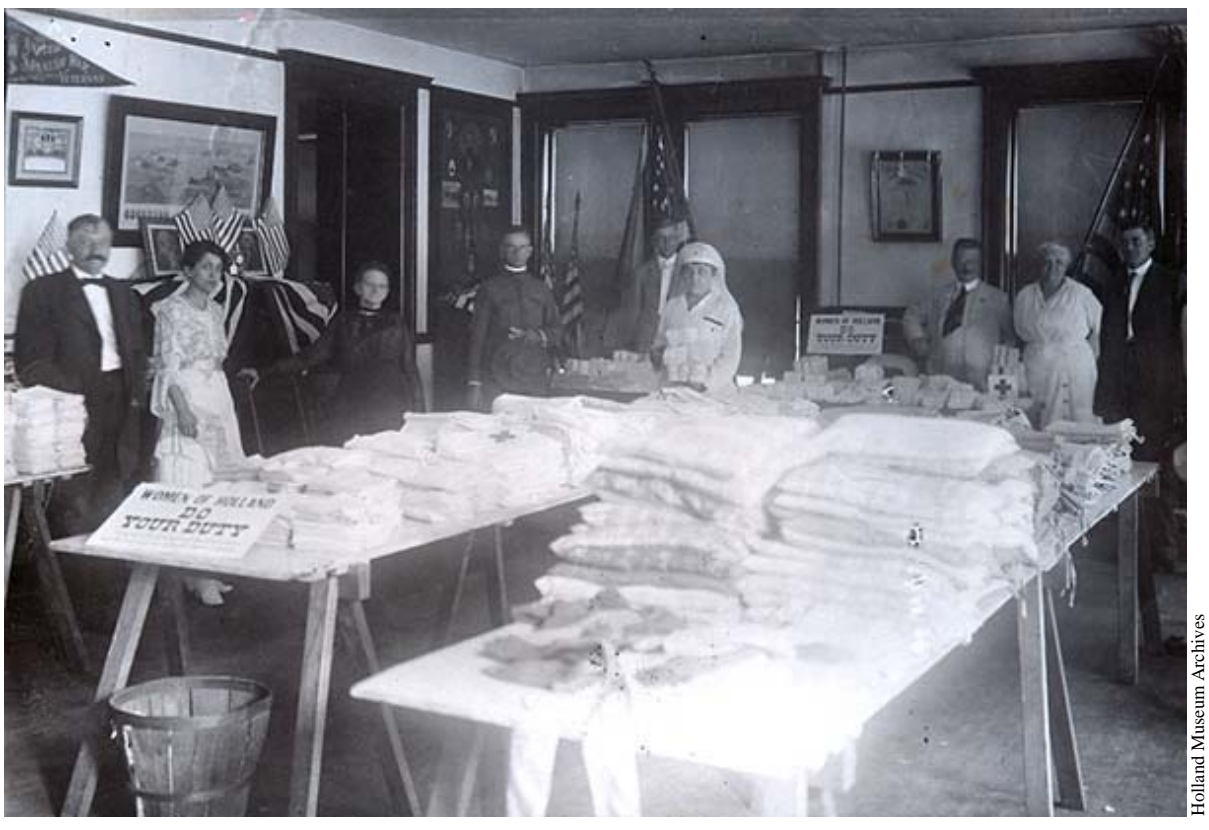
Holland division of the Red Cross members rolled bandages and folded linens for the war effort, 1918