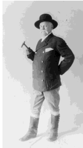
Edward Payson Weston

This is the strange story of how a lost bet impacted and intertwined the lives of two men. In 1860, Edward Payson Weston, “Weston” to most who knew him, found himself in a Boston pub arguing politics. The idea of Abraham Lincoln being elected president repulsed Weston to the degree it embraced his verbal antagonist. The heated exchange brewed a challenge. If Lincoln won, Weston would attend the president’s inaugural....arriving on foot! The bet required a 478-mile trek from the State House in