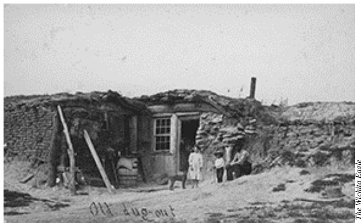
Typical dug-out dwelling used by Kansas settlers in the 1870s