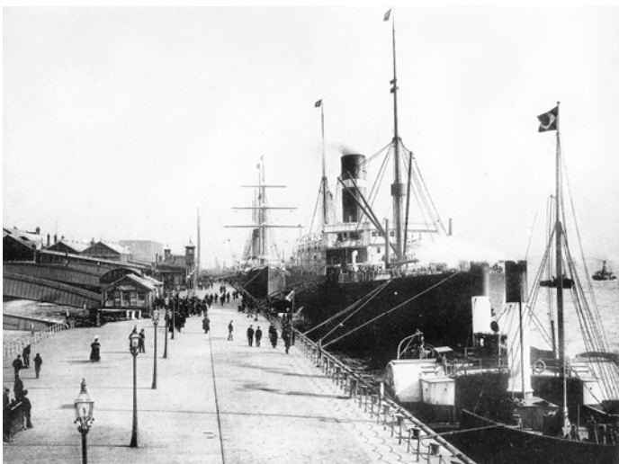
Landing stage for ships leaving Liverpool, England, during the 1860s

Weerts' village in Drenthe to the sites in England was astonishing. Instead of using horses, farms were being plowed with steam engines. The emigrants saw stone palaces and huge quarries. Their train passed through mountains with long tunnels, and passed majestic churches, estates, and buildings. 9 Once in Liverpool, steamship companies offered lodging for one to several days, until the ship was ready to leave. Throughout the whole journey, the emigrants had to keep a careful eye on their suitcases to guard against thieves snatching them. 10