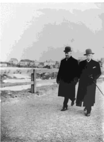
Edward Payson Weston (right) and walking partner, n.d.