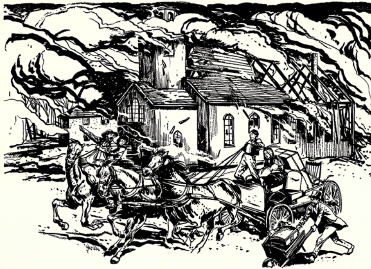
HOLLAND'S DISASTROUS FIRE - 1871

For the purpose of recounting events around the fire for Quarterly readers of this tragic event that took place 144 years ago, I have selected excerpts from the detailed “A Contemporary Account of the Holland Fire,” included in a number of books about Holland.