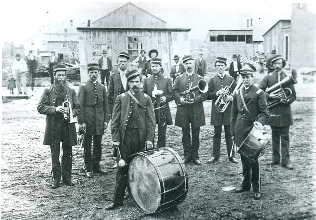
Holland Historical Trust

Contact us at (616) 395-7798 • Fax (616) 395-7197 • E-mail: archives@hope.edu • www.jointarchives.org