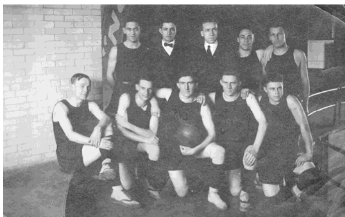
Hope College's 1916-1917 team

The writer's concerns notwithstanding, by 1914 a Calvin College Athletic Association had formed, to manage what was essentially an intramural baseball league at Calvin. This may not have satisfied another Chimes writer, who in September 1915, in a column primarily devoted to intramural sports, editorialized succinctly: "As was the case in previous years, Calvin will not indulge in [intercollegiate?] athletics this year."