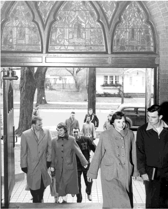
Students entering Dimment Chapel for worship

gave him pause, and he offered other suggestions to better nurture the religious life at Hope.