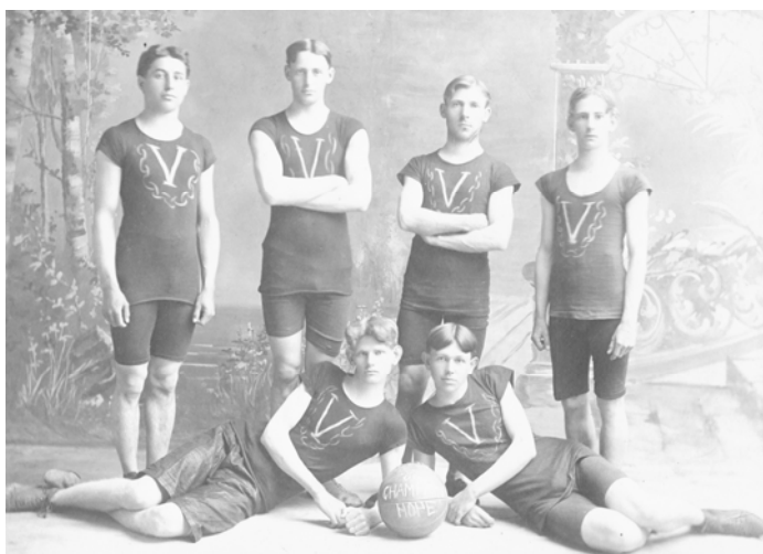
Hope College's first basketball team, 1900-1901, sports the varsity letter on their uniforms