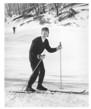
Young skiers frequented Carousel Mountain and hoped to become as good as Olympic skiers

In February 1968, Carousel reported an 18-22 inch base, 4 inches of powder and excellent skiing. In early March,