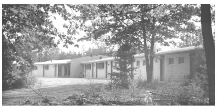
Motel built at the entrance of Carousel Mountain, ca. 1964

In summer 1963, Norm paid for a special meeting of the Laketown Township board. Board members represented the conservative religious views of most people living in the township at the time. The board informed Norm that they would not issue a license to sell intoxicating beverages, and they were not in agreement with Carousel's plan to operate on Sunday. Carousel was free to operate on Sunday in spite of the board's opposition, but to serve alcoholic beverages, Carousel needed the township's approval. Norm felt disappointed but still hopeful.