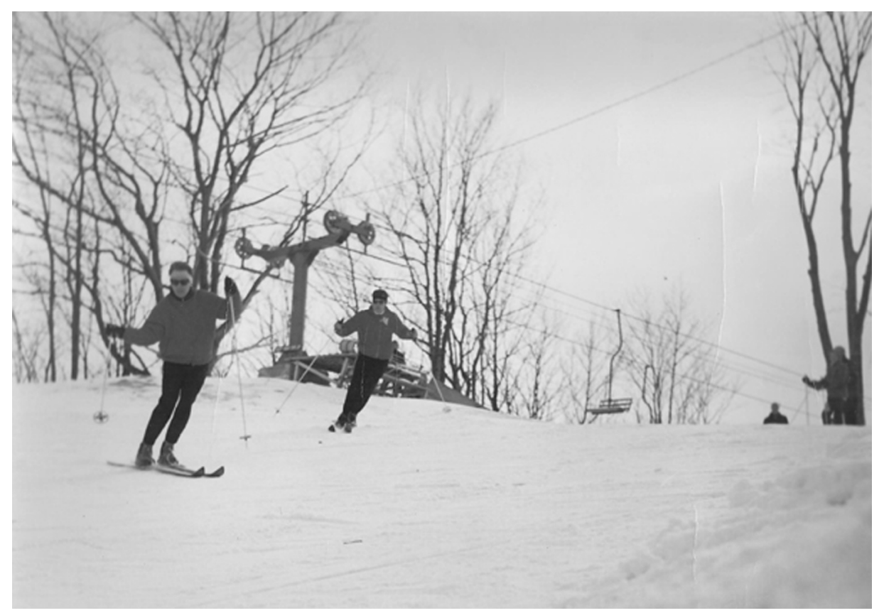
Skiers enjoying the slopes at Carousel Mountain, ca. 1964

Contact us at (616) 395-7798 • Fax (616) 395-7197 • E-mail: archives@hope.edu • www.jointarchives.org