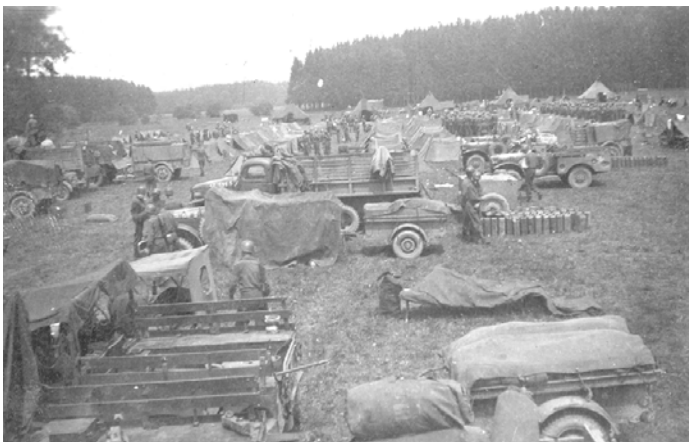
Setting up camp, ca. 1944

Each day felt like the next, and some aspects of the war are now blurred for Kuiper, but several moments from wartime Europe are still especially clear. The American line pushed back the Germans every couple of days with the battle's progression, meaning that the battery moved around more often than not. Relocating camp took a great amount of energy; moving the howitzer cannons in particular was no small feat. The amount of energy, time, and money expended throughout the course of the war in general was truly astronomical. For every soldier in the front line, there were about five men following behind, moving supplies, gas, ammunition, and other equipment to replace everything lost in combat.