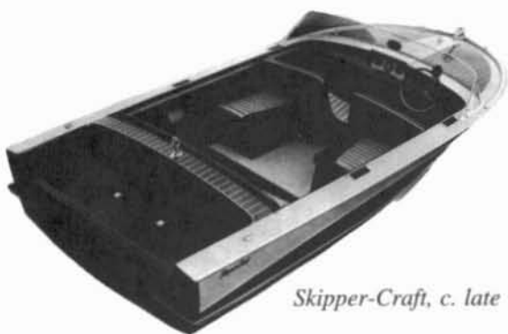
Skipper-Craft, c. late 1950s