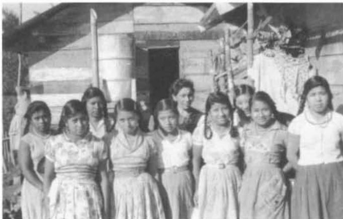
Western Seminary/Joint Archives