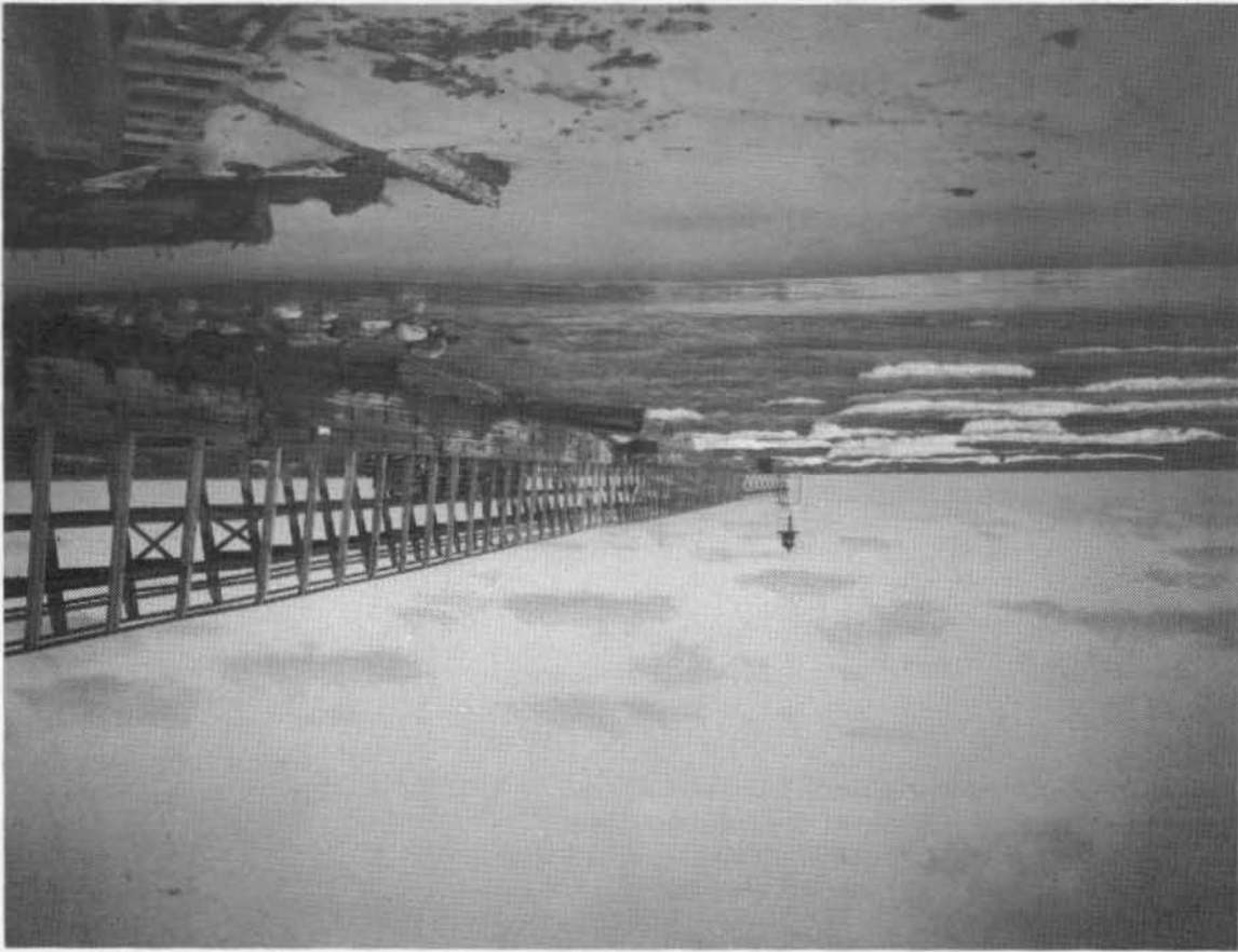
Before Big Red. Holland's south pier at the turn of the century.