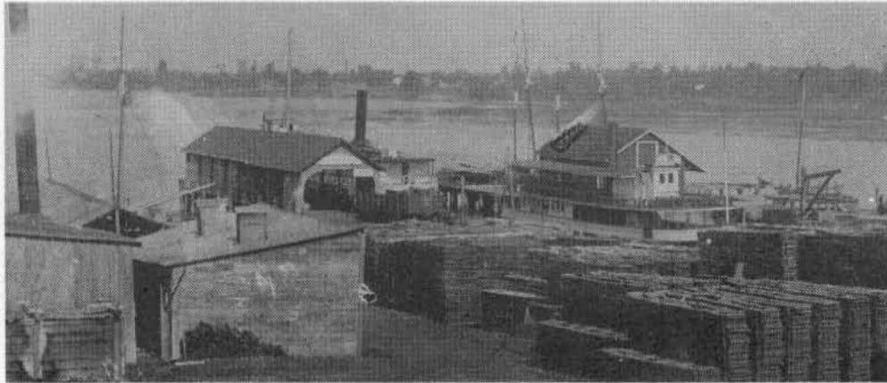
Fixtures Stave Factory on Black Lake, 1884