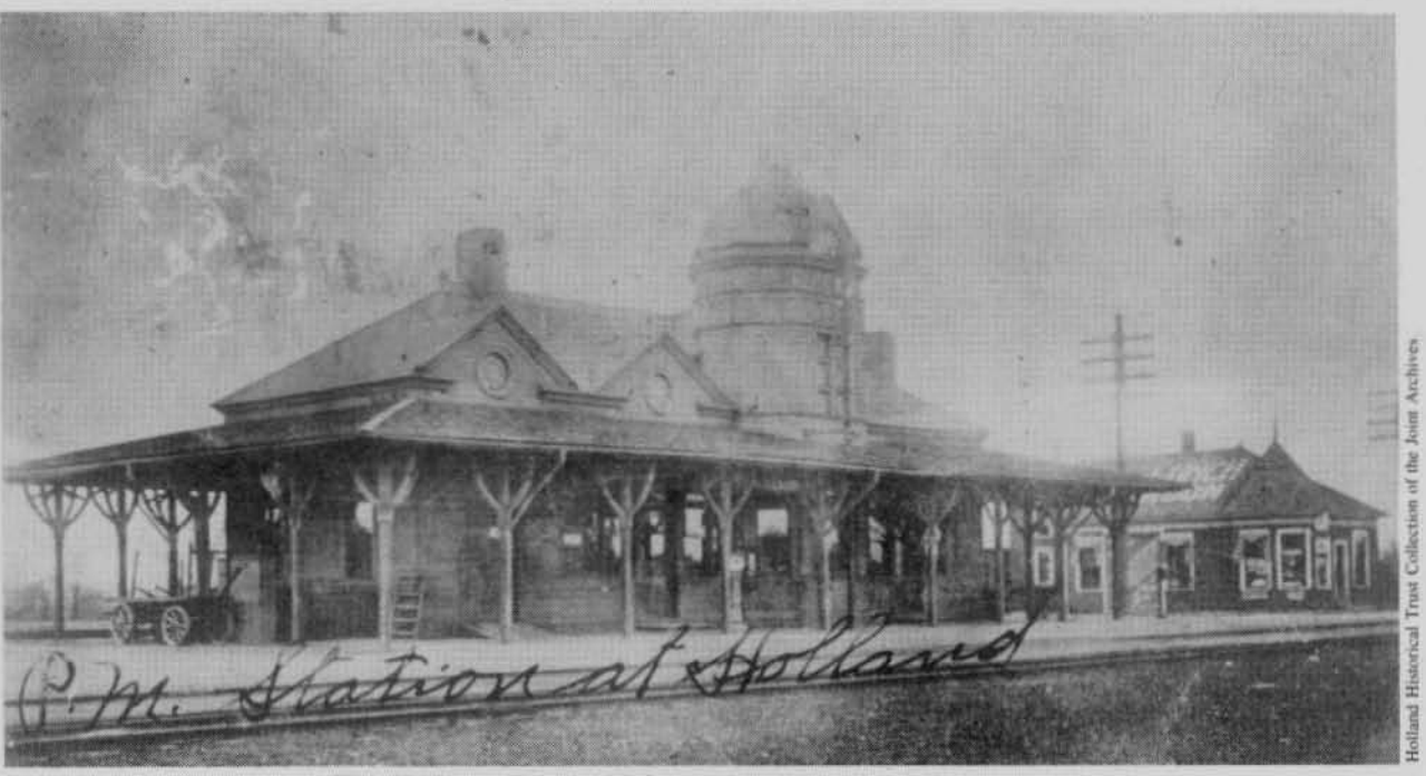
The Holland depot which preceded the current structure.

Locomotives, trains, railroading — they have been part of the fabric of American life for more than 150 years. It was the railroads that helped make travelling easier in the United States in much of its post-Revolutionary period. Rather than requiring days and weeks to arrive at a distant place it could be accomplished in only a fraction of that time.