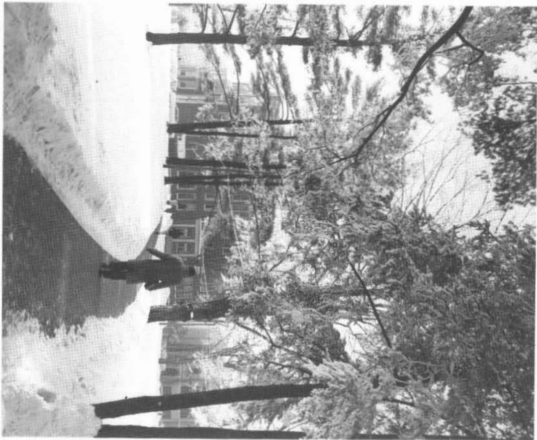
A Winter Scene in the Pine Grove at Hope College Van Raalte Hall can be seen in the distance