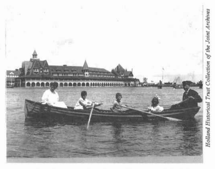
A Lazy Summer Day at the Ottawa Beach Hotel

The Joint Archives of Holland is now seeking a new professional archivist to fill the position of Col-