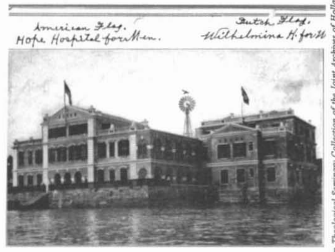
HOPE AND WILHELMINA HOSPITALS, AMOY, CHINA

Western Theological Seminary Collection of