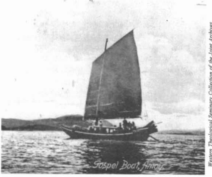
Gospel Boat, Amoy, China