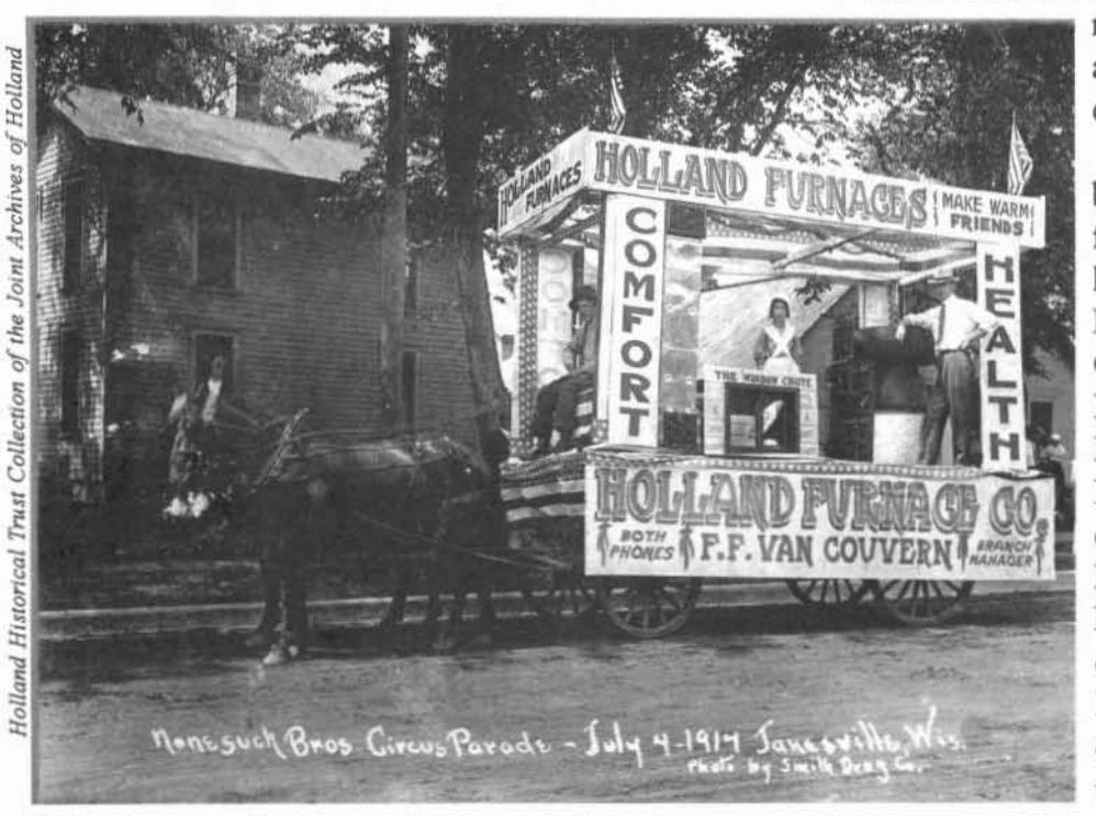
Holland Furnace Co. Float at the Nonesuch Bros. Circus (Janesville, Wis.), July 1914

If you've ever wondered how banks managed their accounts before computers and ATMs, we now have records available from Holland's oldest banks: Holland City State Bank, First State Bank, Holland State Bank, First National Bank, and Peoples State Bank. A long history of mergers connects Holland City State Bank to First National Bank. Peoples State Bank has many photographs and a detailed history of its beginnings. Important financial information about early local businesses is also contained in these records