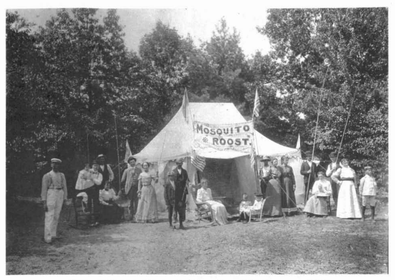
Summer Campers Brave the Mosquitos at Waukazoo, c. 1900